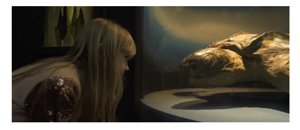
One day at Natural History Museum Rijeka <a href="https://www.youtube.com/watch?v=3lxJWicHT_o">https://www.youtube.com/watch?v=3lxJWicHT_o</a>

A cultural spot for Natural History Museum Rijeka to present the exhibitions and encourage people to visit.