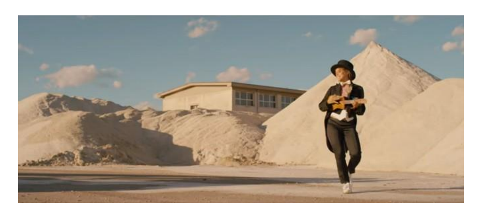
Video clip "Gianna", song by Rino Gaetano https://www.youtube.com/watch?v=laIH5AOgeH0

The famous song by Rino Gaetano celebrates its 40<sup>th</sup> anniversary this year and, to celebrate it in the best possible way, a videoclip was made in the unique scenery of the Po Delta Park in two of the pearls of the territory: Cervia with its salt pans, the sea and the historical heritage of its historic center; and Mesola, a place where the presence of the Este dukes in the Castle and the beauty and uniqueness of the Bosco della Mesola remain indelible. The idea of creating a union between creative industry, musical arts and digital expressions intends to reach and speak to the younger generations, narrating with the instruments and techniques so well known to the digital natives what were modern poems for the youth of the seventies - now the their parents - and that today are attracting strong attention in the younger generations.