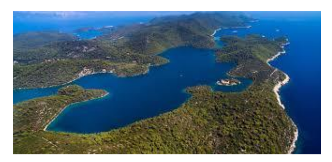
The island of Mljet