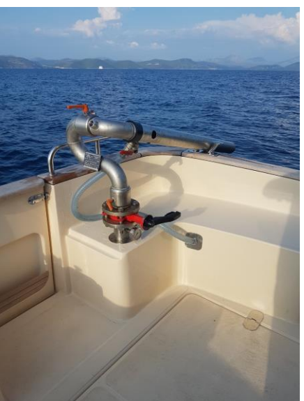
Exercises and surveillance by the firefighting boat Saint Florian