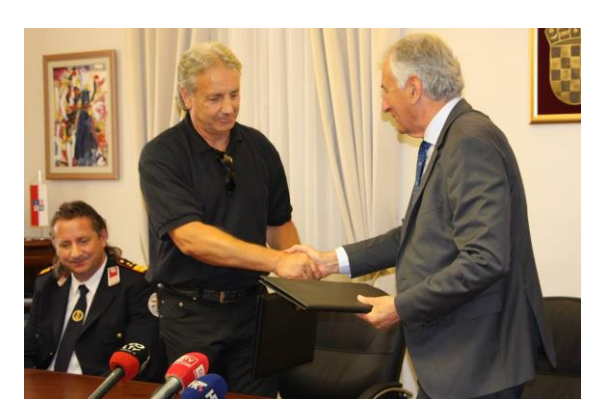
Signing of the Contract in September 2018