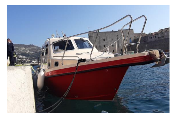
Inauguration of the Saint Florian