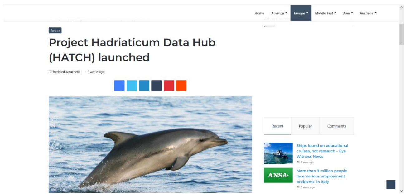
Figure 2. Article 2

European Regional Development Fund www.italy-croatia.eu/hatch