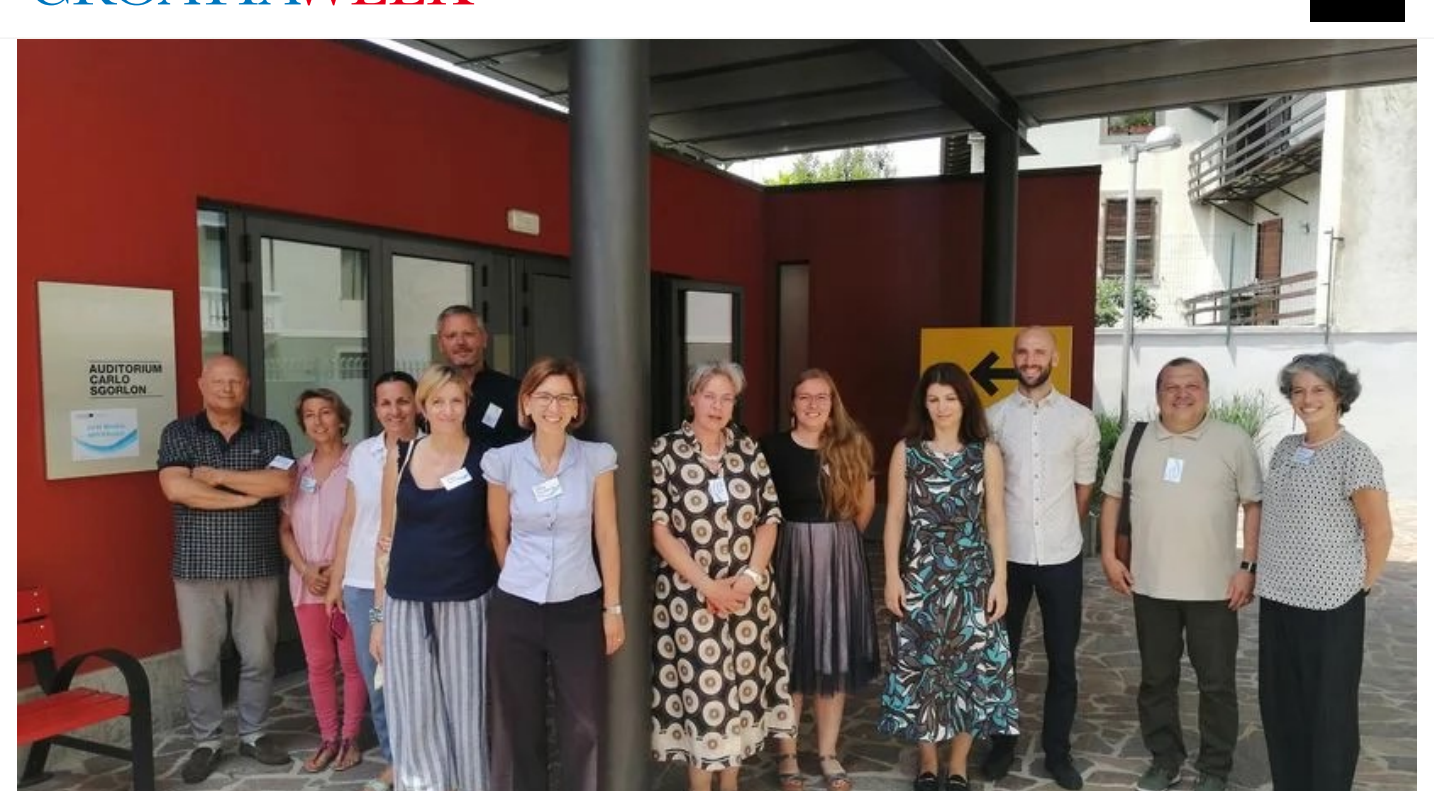
HATCH Partner Meeting

This is the main motivation behind the HATCH project – to exchange experiences and results from the past projects and develop protocols for standardization of data coming from diverse programs aimed at research and monitoring of microbiological, chemical and physical water quality, pollutants, underwater noise and conservation status of animal and plant species. Besides this, HATCH project will produce guidelines on the application of multi-disciplinary data in Marine Spatial Planning and develop proposals for the new cycle of research and monitoring to be conducted within the upcoming funding period of Interreg Italy-Croatia 2021-2027.