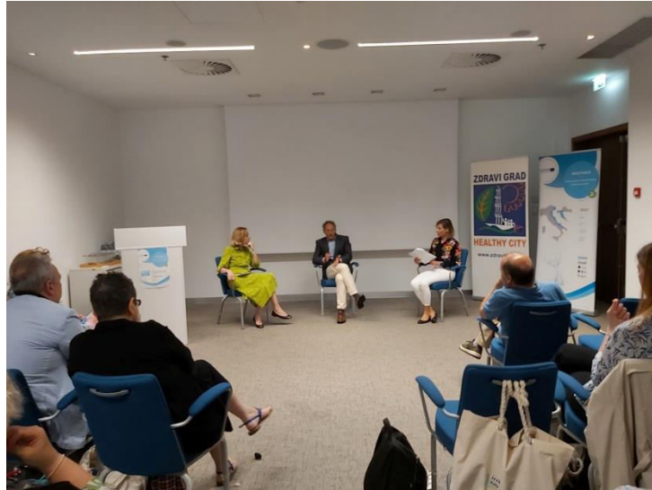
Figure 5: Workshop