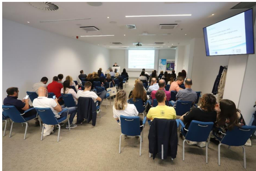
Figure 4: Final conference