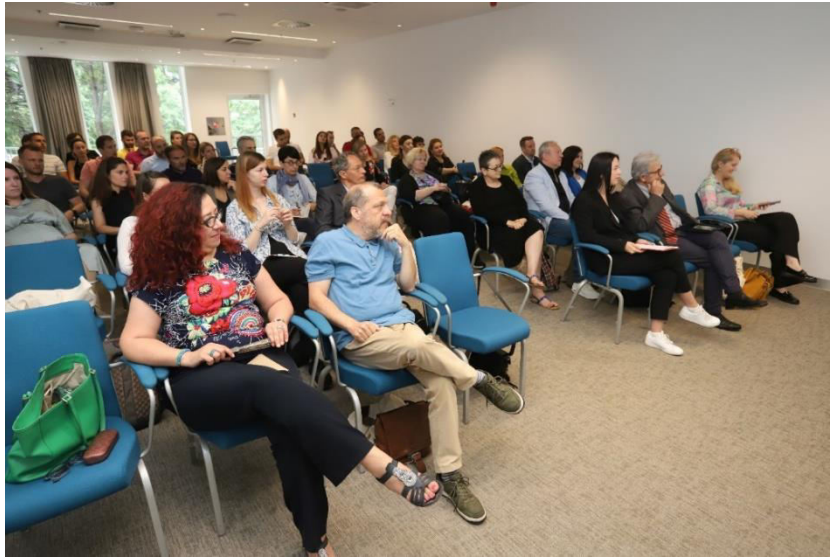
Figure 1: Final conference