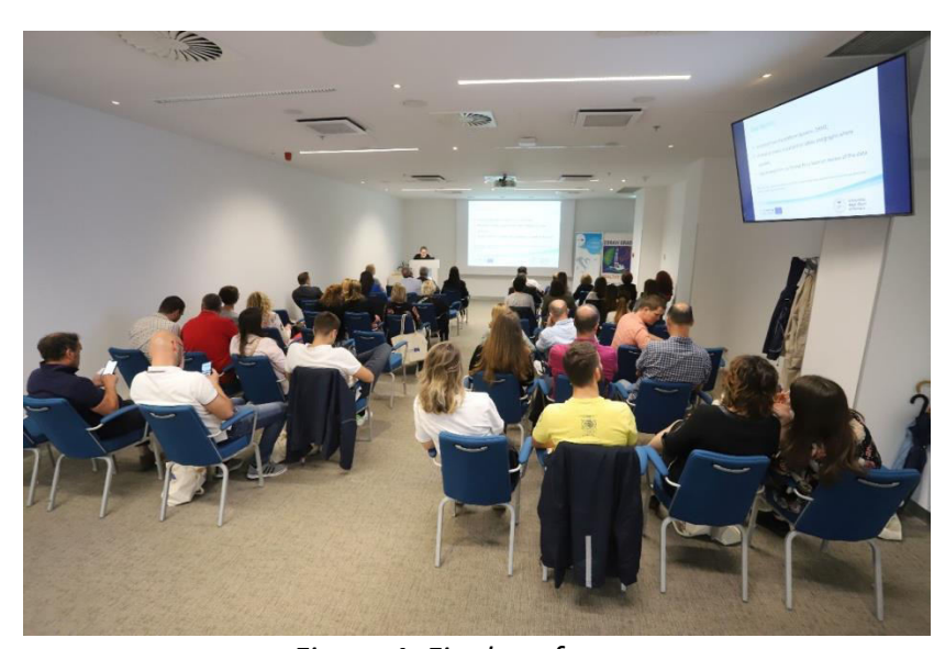
Figure 4: Final conference