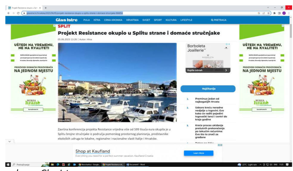
Figure 6: Press release_Glas Istre

\underline{https://www.glasistre.hr/hrvatska/2023/06/05/projekt-resistance-okupio-u-splitu-strane-i-domace-strucnjake-866854}