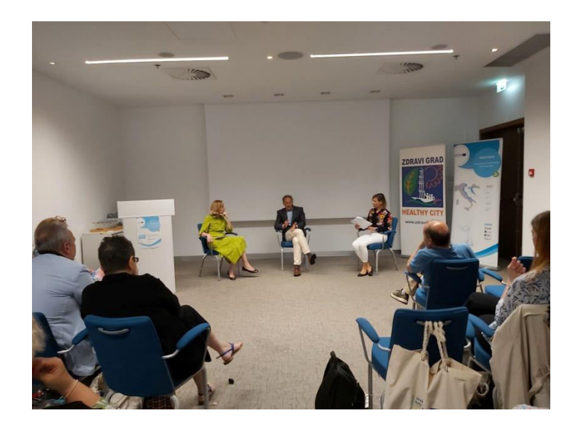
Figure 5: Workshop