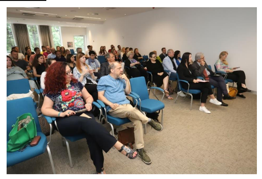
Figure 1: Final conference