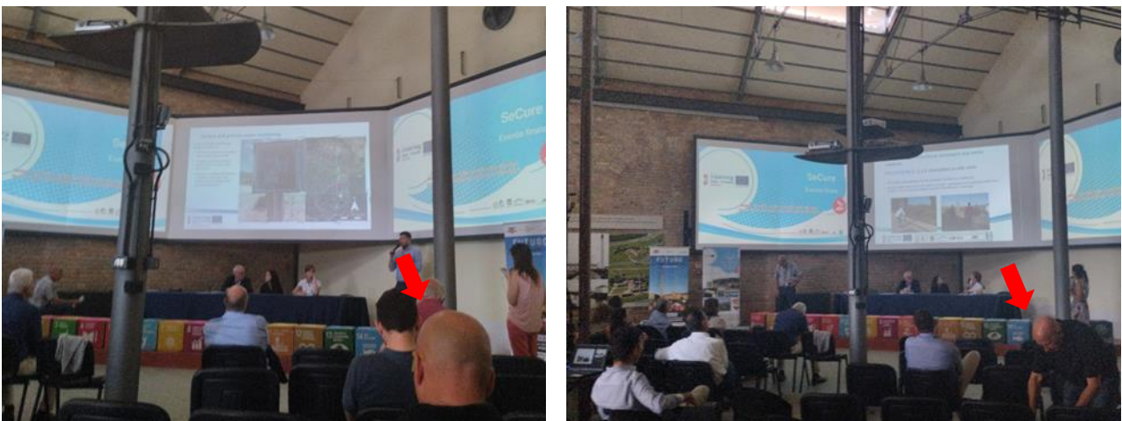
Fig. 4 – Leandro Maggi visiting the Italian site during the SeCure Final Event on June 28 th , 2023