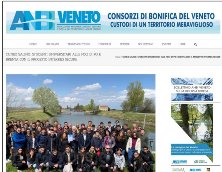
Fig. 2 - View of the institutional page of the ANBI Veneto website

A print-screen of the webpage is provided in Fig. 2