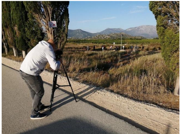
Fig. 5 – Journalists visiting the Croatian site on November 3 rd , 2022