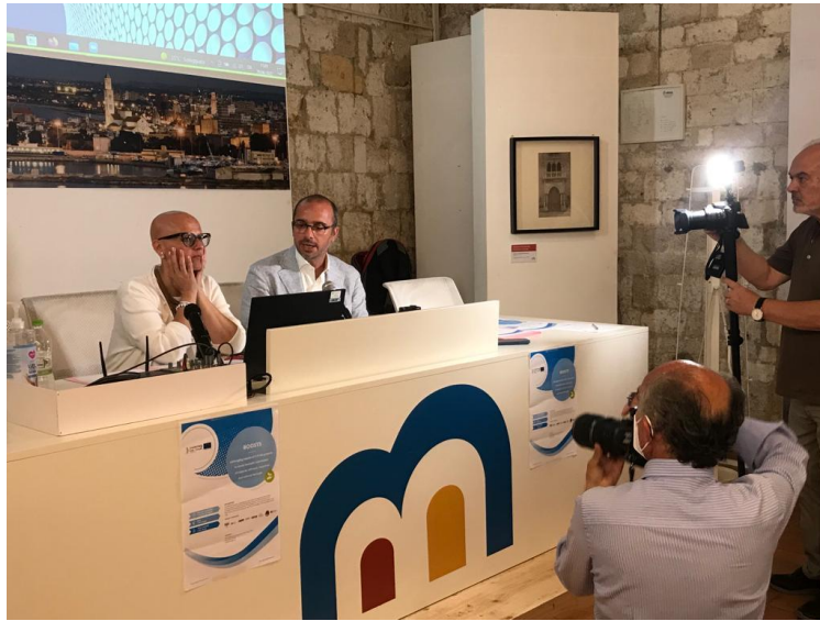
Invitation press conference