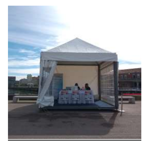
Foto: stand del progetto SUTRA dove è stato possibile noleggiare le bici

The event was mainly attended by citizens, adults and younger people, interested in the initiative.