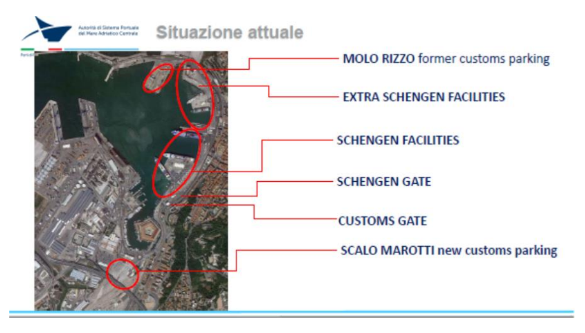
Figure 4: Ancona ferry port infrastructures and location of Scalo Mariotti

A feasibility study identified the former railways yard "Scalo Marotti" as the best solution to set up the new customs parking.