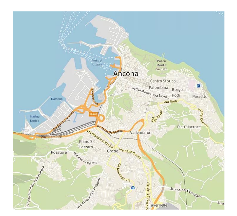
Figure 1: Layout of Ancona and its port

The Port of Ancona is located in the middle of the Italian Adriatic coast, precisely in the Gulf of Ancona, between two hills. Its natural position allowed since roman period to be a strategical point of reference and a natural safe shelter for navigators and sailors. The city is situated between the slopes of the two extremities of the promontory of Monte Conero, Monte Astagno and Monte Guasco and it represents the main economic and demographic center of Marche Region. Ancona area is characterized by a hilly landscape with numerous valleys and by the presence of several beaches, both rocky and sandy. Ancona area is classified as medium-high seismicity zone (level 2) by the Italian civil defense.