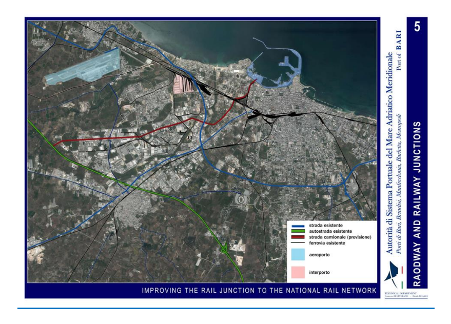
Figure 5: Rail junctions improvement plans in Bari

The priority objectives of the investments of the fundamental railway structure, contained in the PON Infrastructures and Networks (Priority Axis I, with 1.094 billion Euros by 2023) or in the MIT-RFI Program Contract, contribute directly and primarily to the improvement of the Area Integrated Logistics Puglia Basilicata, as they represent the main corridors of communication of the ALI for exchanges outside the region. The priority investments are for: