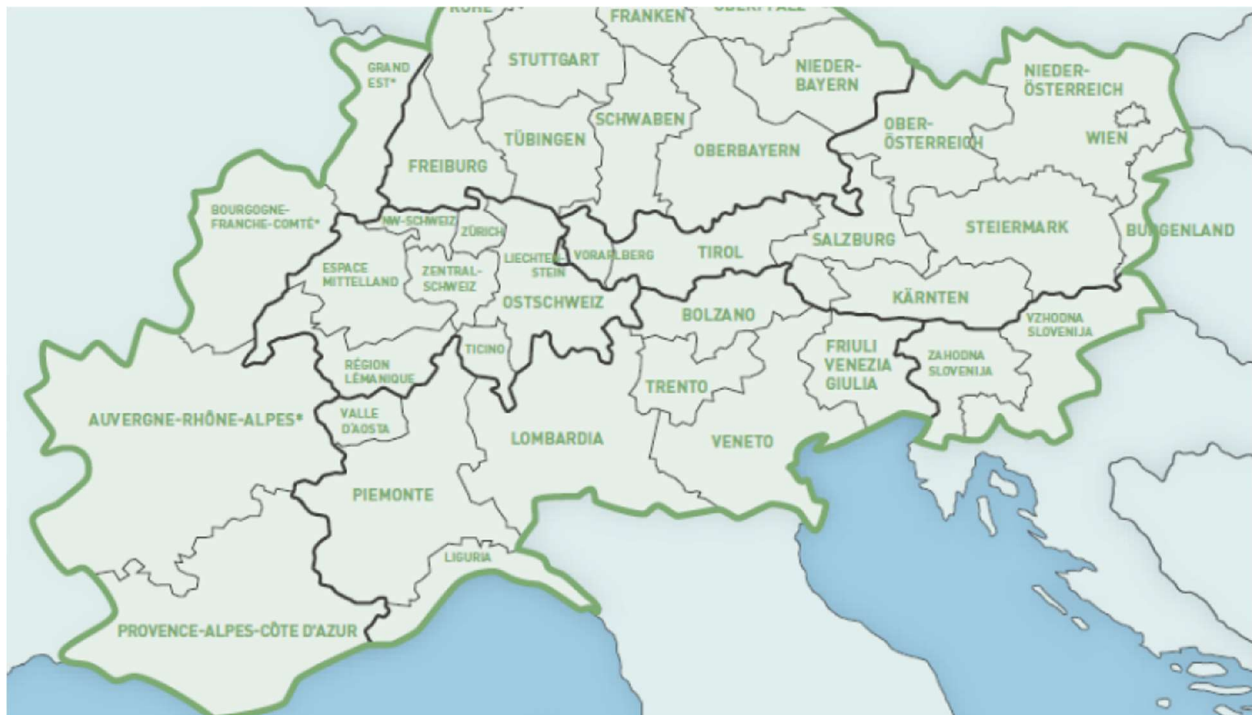
EUSALP participating countries

The EUSALP covers seven Countries, of which 5 EU Member States (Austria, France, Germany, Italy and Slovenia) and 2 non-EU countries (Liechtenstein and Switzerland), and 48 Regions.