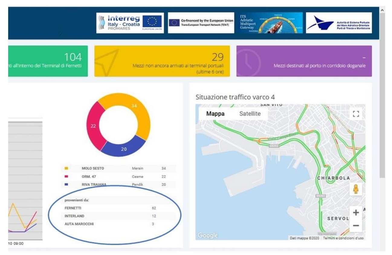
Figure 8: Details on the trucks arriving from the different buffer areas

The results gained with this pilot actions have important impact on the Port Community, since this initiative helped to support the management of the traffic in a particular period like the lockdown caused by the Covid-19. Therefore, this action is really appreciated by the operators. Figures below show the screenshots taken directly from the PCS Sinfomar.