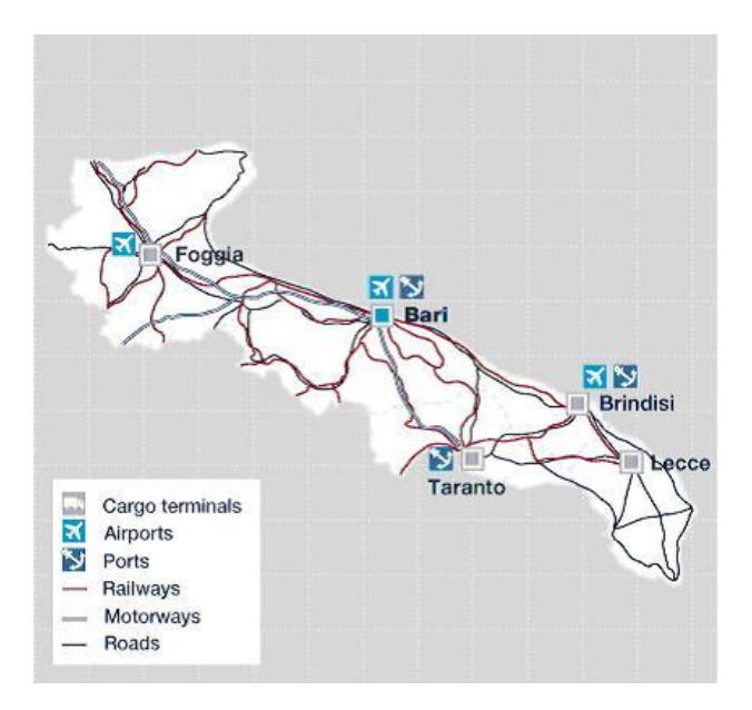
Figure 6: Network connecting Bari and ports covered by same governing entity

Particular attention must be paid to terrestrial integration with the railway network in order to intercept long-distance traffic that currently mainly uses the road system consisting of the Adriatic highway backbone linking Lecce, Brindisi, Bari, Foggia with northern Italy but also that towards Naples , Rome, Florence.