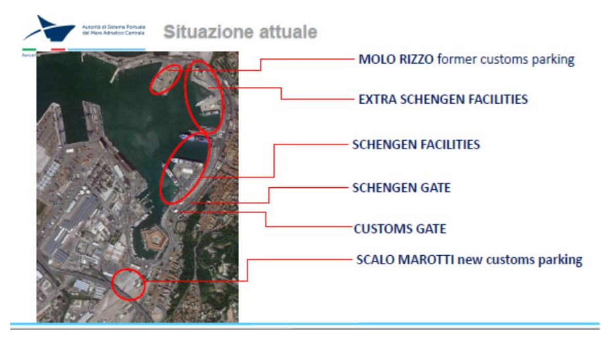
Figure 4: Ancona ferry port infrastructures and location of Scalo Mariotti

A feasibility study identified the former railways yard "Scalo Marotti" as the best solution to set up the new customs parking.