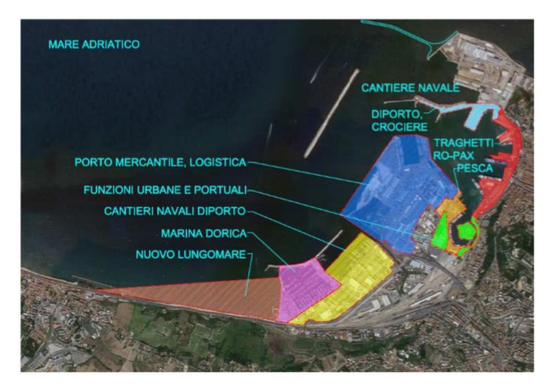
Figure 3: Port areas split according to the use destination

The quays are equipped with stationary cranes, unloading cranes, electric mobile cranes, hydraulic mobile cranes, pneumatic grain elevators.