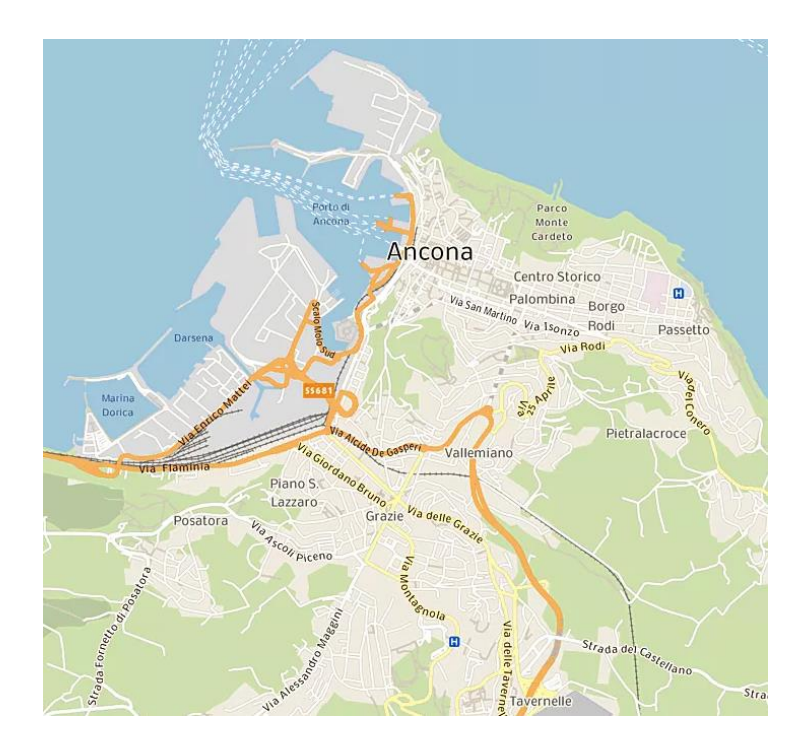
Figure 1: Layout of Ancona and its port

The Port of Ancona is located in the middle of the Italian Adriatic coast, precisely in the Gulf of Ancona, between two hills. Its natural position allowed since roman period to be a strategical point of reference and a natural safe shelter for navigators and sailors. The city is situated between the slopes of the two extremities of the promontory of Monte Conero, Monte Astagno and Monte Guasco and it represents the main economic and demographic center of Marche Region. Ancona area is characterized by a hilly landscape with numerous valleys and by the presence of several beaches, both rocky and sandy. Ancona area is classified as medium-high seismicity zone (level 2) by the Italian civil defense.