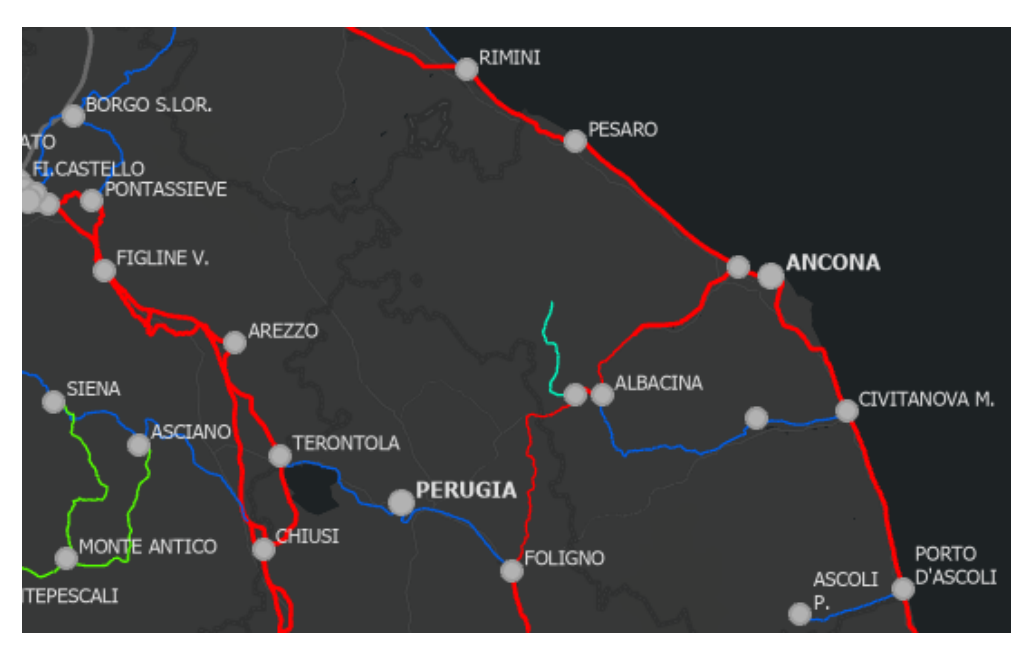
Figure 2: Railway network of Marche region

The city of Ancona is connected to the national railway network, precisely to the Adriatic railway line, through the central station situated near the port along via Flaminia.