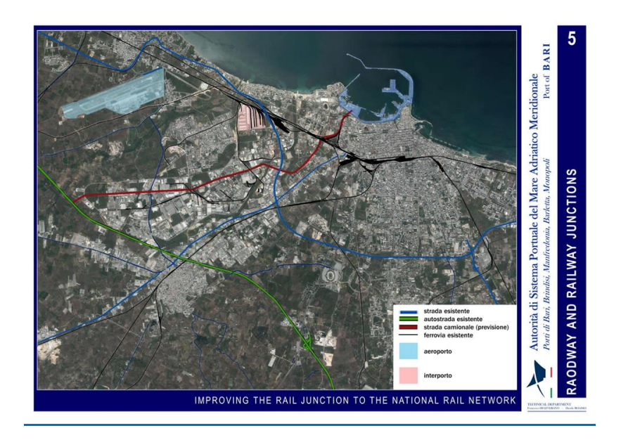
Figure 5: Rail junctions improvement plans in Bari

The priority objectives of the investments of the fundamental railway structure, contained in the PON Infrastructures and Networks (Priority Axis I, with 1.094 billion Euros by 2023) or in the MIT-RFI Program Contract, contribute directly and primarily to the improvement of the Area Integrated Logistics Puglia Basilicata, as they represent the main corridors of communication of the ALI for exchanges outside the region. The priority investments are for: