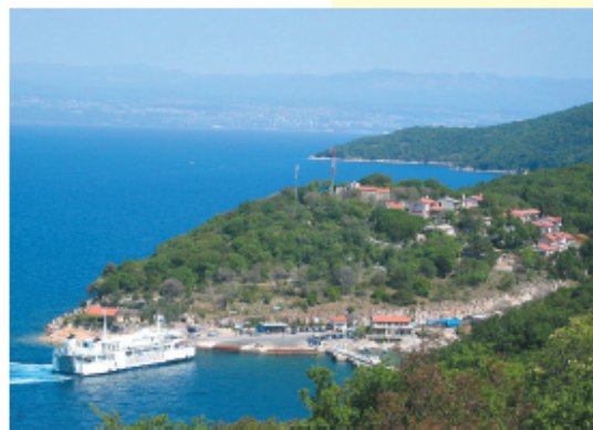
Reference ship of the project, M/V Bol, berthed at Porozina Port