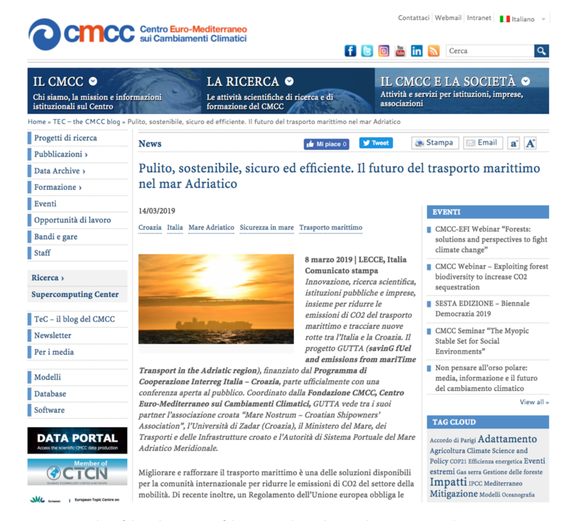
Figure 2 Screenshot of the Italian version of the CMCC webpage hosting the GUTTA press release

\frac{https://www.cmcc.it/it/politica-climatica/clean-sustainable-safe-and-effective-the-future-of-maritime-transport-in-the-adriatic-sea}{transport-in-the-adriatic-sea}