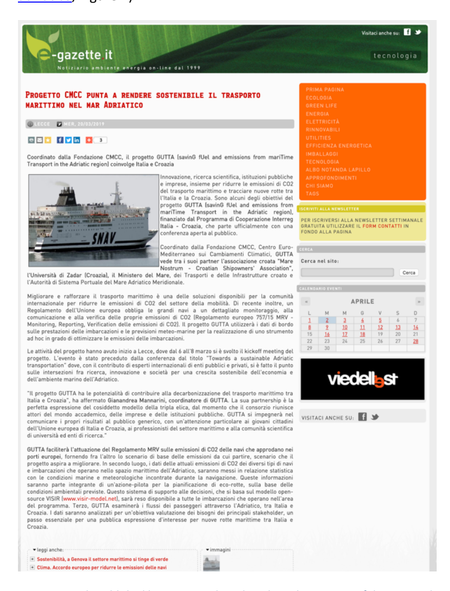
Figure 4 Article published by e-gazette, based on the Italian version of the Press Release.

The weekly magazine e-gazette.it, is a portal for news on environment and energy. They claim "100,000 monthly visits and 10,000 unique readers per week" (<a href="http://www.e-gazette.it/chi-siamo">http://www.e-gazette.it/chi-siamo</a>). On March 20, 2019 e-gazette.it published news about the GUTTA opening conference (<a href="http://www.e-gazette.it/sezione/tecnologia/progetto-cmcc-punta-rendere-sostenibile-trasporto-marittimo-mar-adriatico">http://www.e-gazette.it/sezione/tecnologia/progetto-cmcc-punta-rendere-sostenibile-trasporto-marittimo-mar-adriatico</a>, Figure 4).