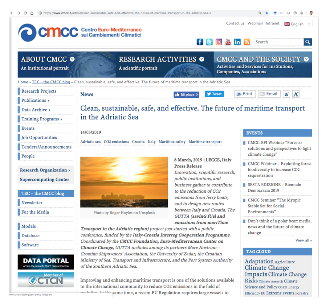
Figure 1 Screenshot of the English version of the CMCC webpage hosting the GUTTA press release.

https://www.cmcc.it/article/clean-sustainable-safe-and-effective-the-future-of-maritime-transport-in-the-adriatic-sea-2