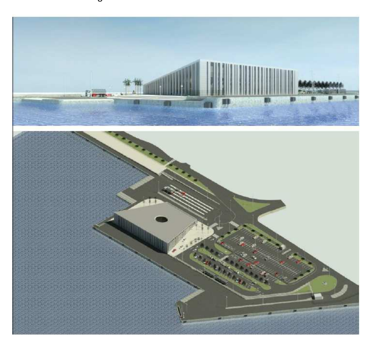
Figure 1: Passenger terminal Port of Šibenik, upgrade of Vrulje quay, building of the passenger terminal with traffic installations from the 3rd phase – architectural 3D visualisation

Architectural 3D visualisation of Vrulje passenger terminal upgrade project with phase 3 installations is shown in Figure 1 that follows.