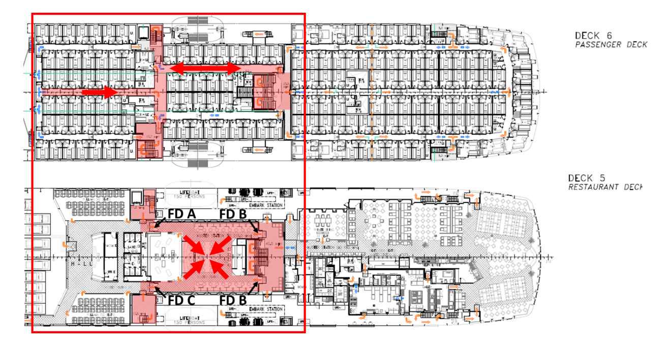
Figure 2 – The area (in red) used during the trials with the doors (FD) that can be closed to simulate the different scenarios

defining three alternative escape routes starting from cabins and arriving at the muster station in the main lounge. The test area is shown in Figure 2.