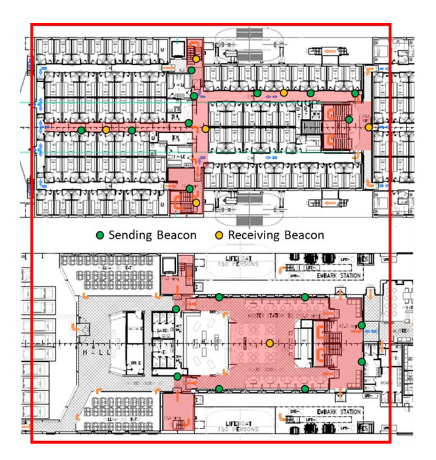
Figure 3 –Type and final position of the becons in the test area

A 37-persons sample population composed as shown in Figure 4 has been employed to test the pilot system functionality in several scenarios, including one or more blocked escape routes. The trials have been carried out with and without the guidance of the system. Due to the SARS-CoV-2 pandemic, the sample population recruitment was strongly limited, as well as the access onboard. The trials have been conducted according to a safety protocol developed to prevent infection from spreading.