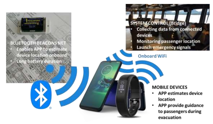
Figure 1: Schematic view of the pilot arrangement and communication between components

In both modes, the APP transmits the device position to the Backend, which shows the location of the connected devices on the ship general arrangement. Both the APP and the Backend will record the data in a log file. The function mode will be selected using the backend application and automatically transmitted to all connected devices. Schematic view of the pilot and its components is shown in Figure 1.