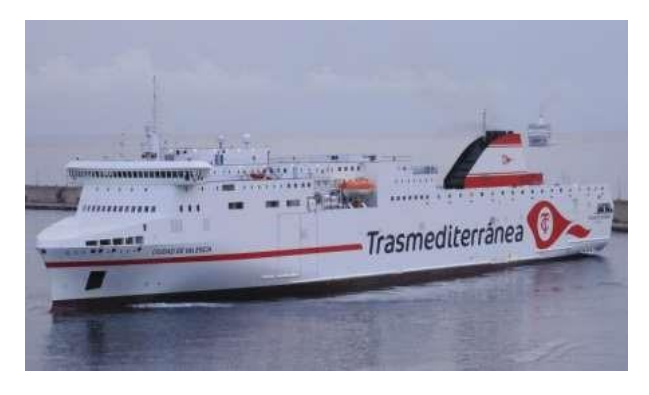
Figure 2: Comparable medium sized ROROPAX vessel

The pilot application will be tested on a medium-size passenger ferry which is currently under construction at Visentini shipyard in Porto Viro. UNITS will sign an agreement with the shipyard, which will put the ship and its Wi-Fi network at disposal free of charge l. The ship is 203 m long overall, has 151 passenger cabins and 32 crew cabins on four decks, and can carry 400-1000 passengers depending on the length of the voyage, along with 260 cars. A sample of similar sized ROROPAX vessel is shown in Figure 2.