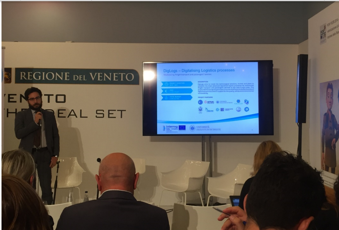
The DigLogs presentation at Venice International Film Festival 2019.