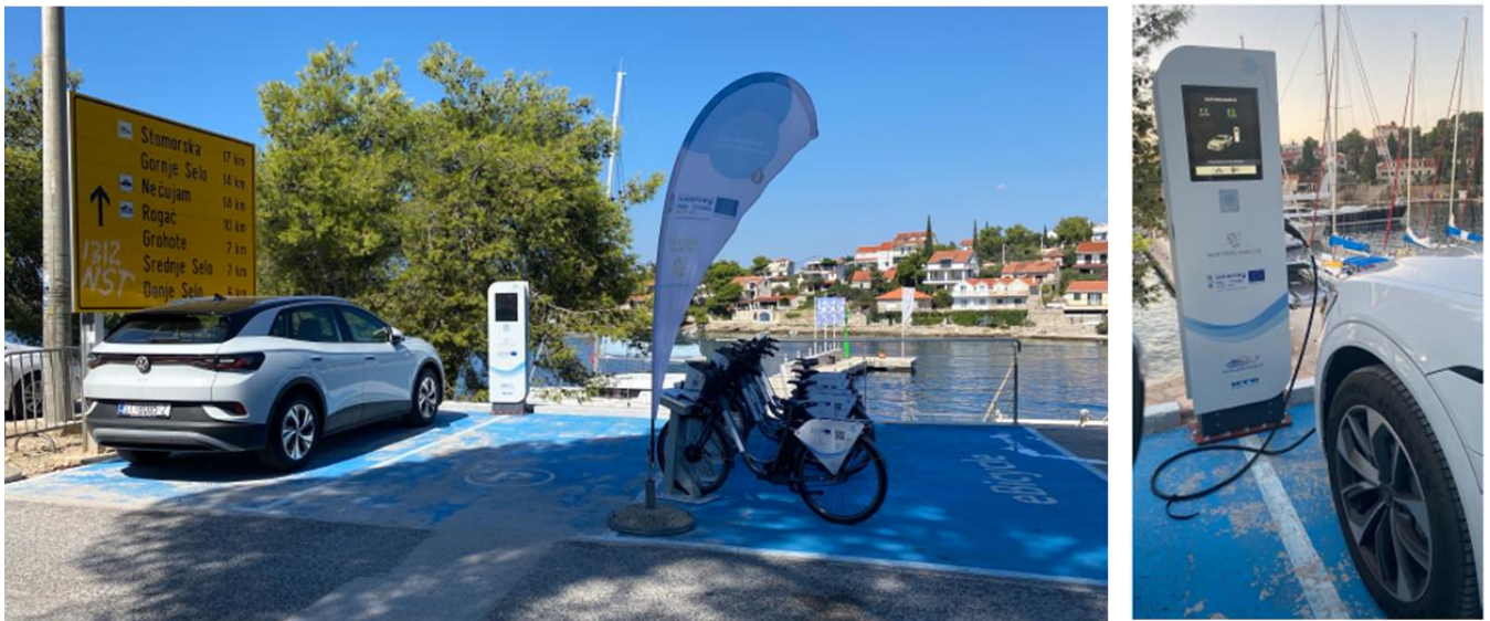
Figure 4 - E-charging station installed in Maslinica-Solta by PP10 Dvorac, within the Martinis Marchi marina.

PP10 Dvorac installed 1 ECS for e-vehicles and e-boats in the Martinis Marchi marina, which is owned by PP10 itself.