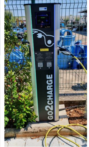
Figure 2 - E-charging stations installed in Krk Island by PP12 Ponikve.