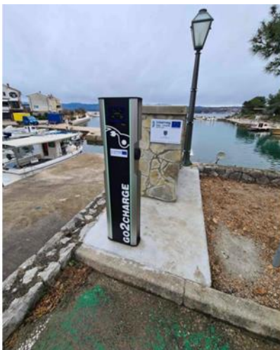
Figure 3 – E-charging station installed in the Municipality of Malinka-Dubasnica on Krk Island by PP06 Malinska.

Figure 2 shows the e-charging station for e-boats installed by PP12 Ponikve in Vrbnik, as well as the charging station for e-vehicles and e-boats in the municipality of Omišalj (Luka Njivice). As predicted by the SWOT analysis, COVID crisis had a negative impact both on implementation phase and monitoring results. The price of the materials has changed, especially steel prices increased on the market, causing some delays in pilot installations.