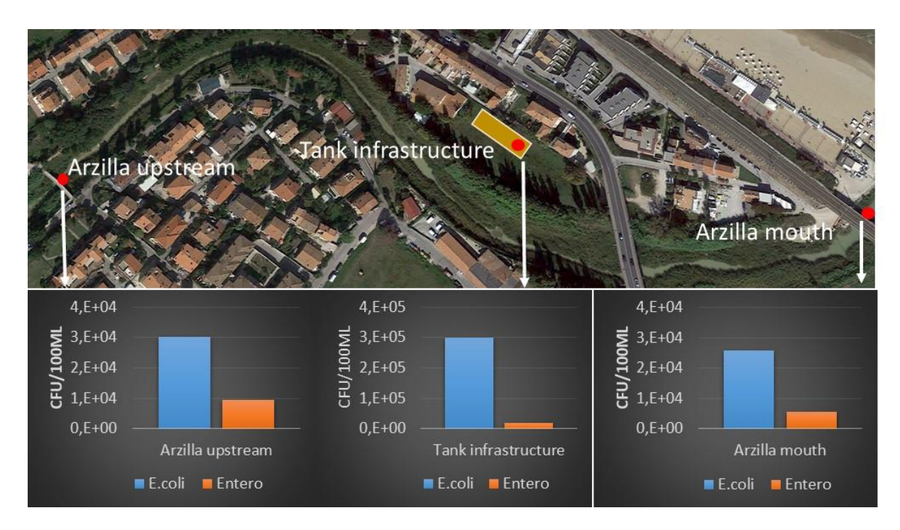
Figure 3. (From: Romei et al. 2021) shows the results of the Escherichia coli (E.coli) and intestinal enterococci (Entero) measured at the three sampling sites (Arzilla River, upstream; Tank; and Arzilla River, mouth) after an intense rainy event (27 mm 30 min<sup>-1</sup>).

However, it is highly likely that part of the E.coli and enterococci found at the mouth of the river came from other overflows upstream of the river that did not find their way to the tank. These results were published in Romei et al. (2021).