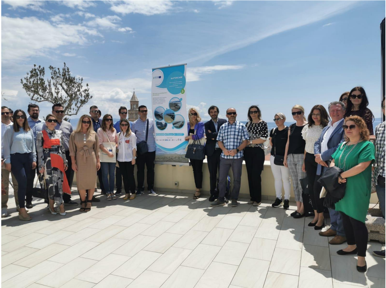
D.2.4.4 - 4th Public Event (central Croatia)