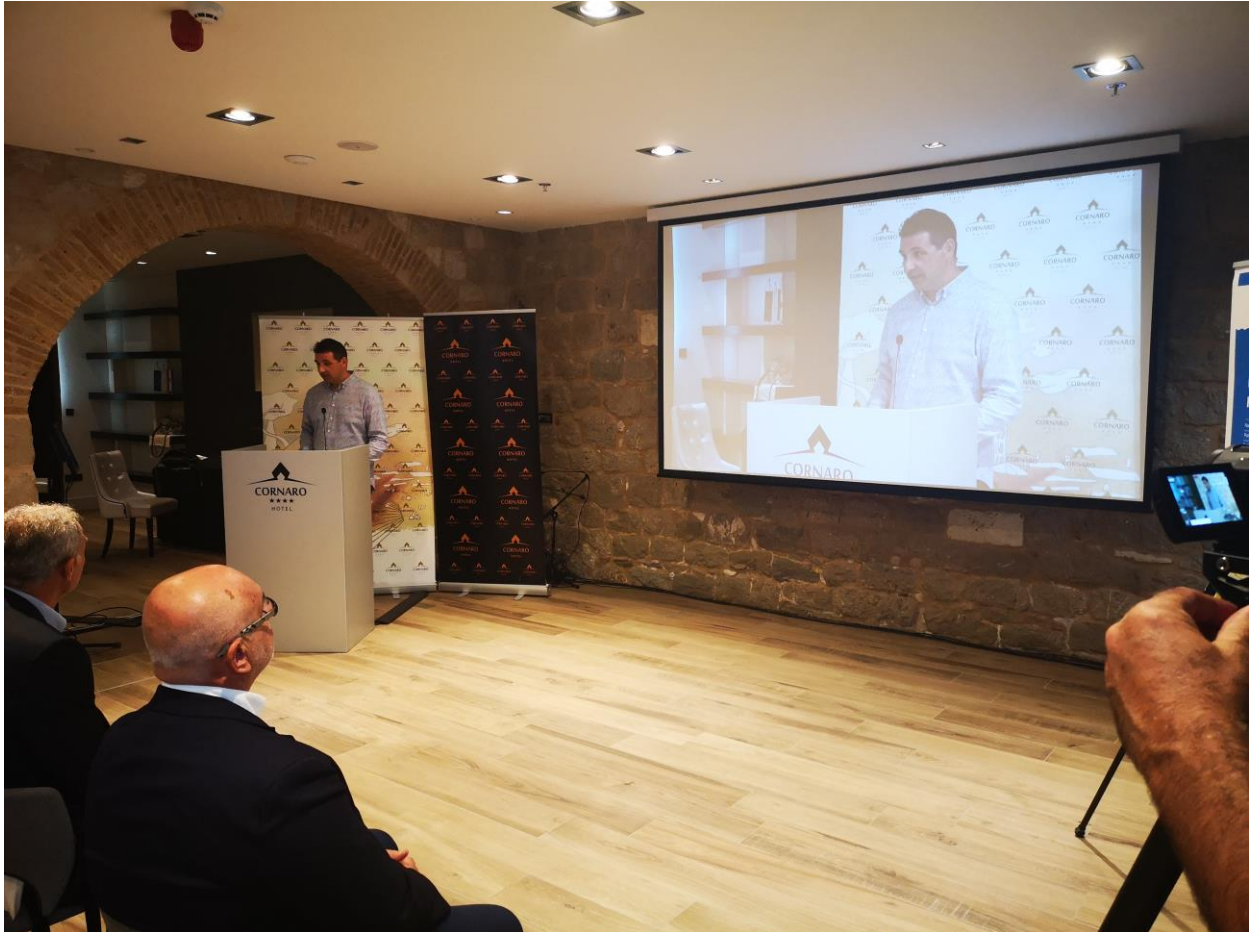
D.2.4.4 - 4th Public Event (central Croatia)