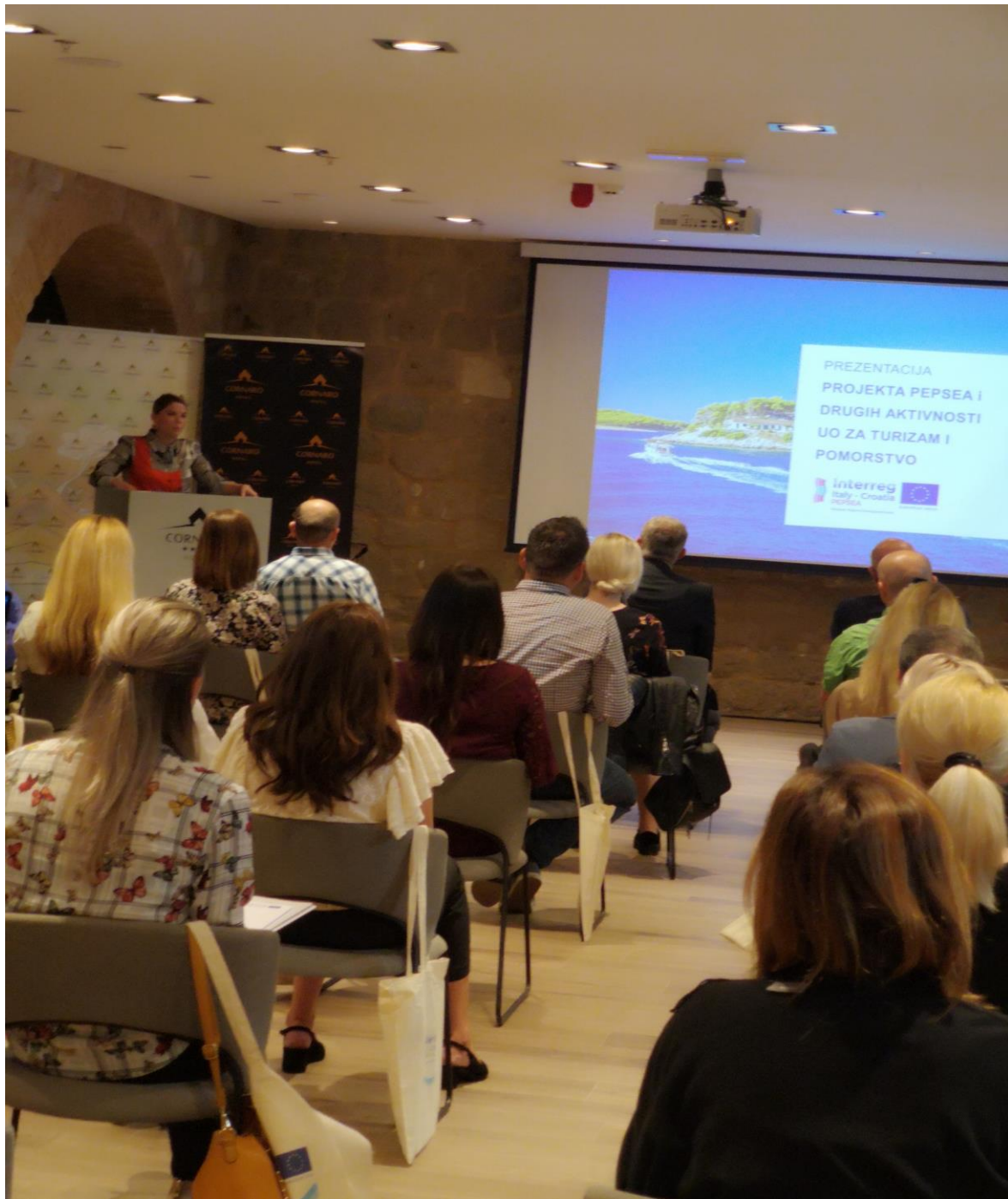
D.2.4.4 - 4th Public Event (central Croatia)