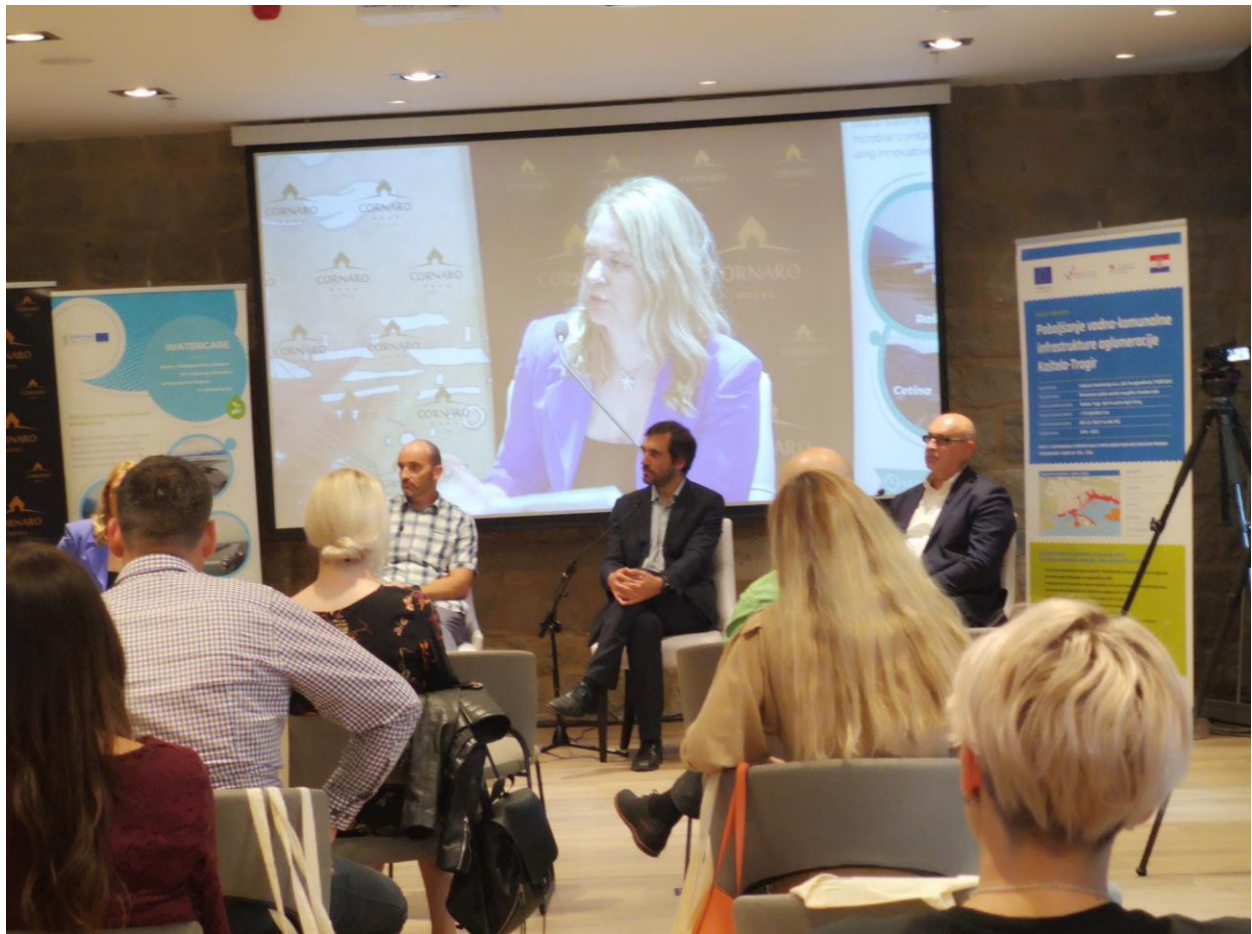
D.2.4.4 - 4th Public Event (central Croatia)