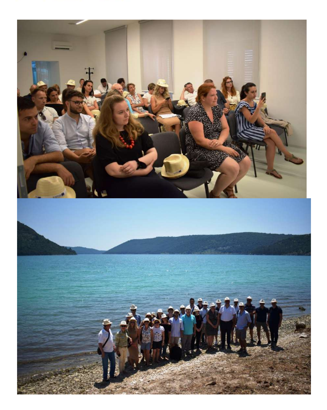
D.2.4.2- 2nd Public Event (northern Croatia)