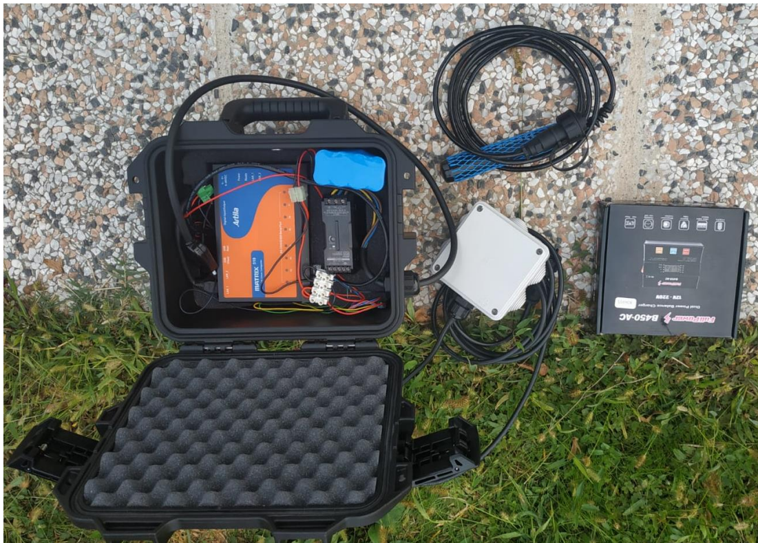
OBU and related accessories: CT, GNSS, Battery, Battery Charger

This deliverable is not a document but the OBU (On Board Unit) Hardware and Software. As proof a picture is reported hereinafter.