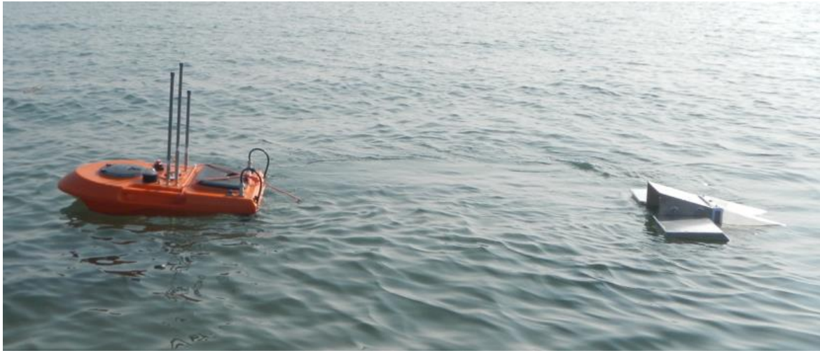
Instrumented drone in operation