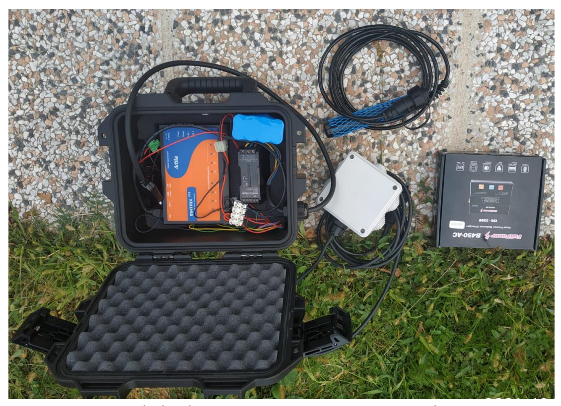
OBU and related accessories: CT, GNSS, Battery, Battery Charger

This deliverable is not a document but the OBU (On Board Unit) Hardware and Software. As proof a picture is reported hereinafter.