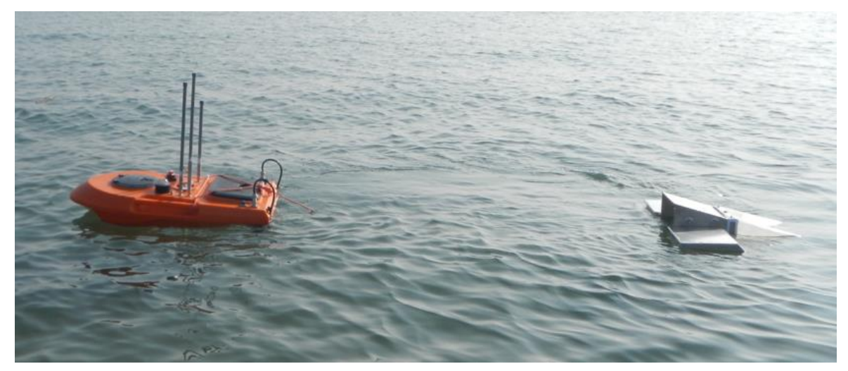
Instrumented drone in operation