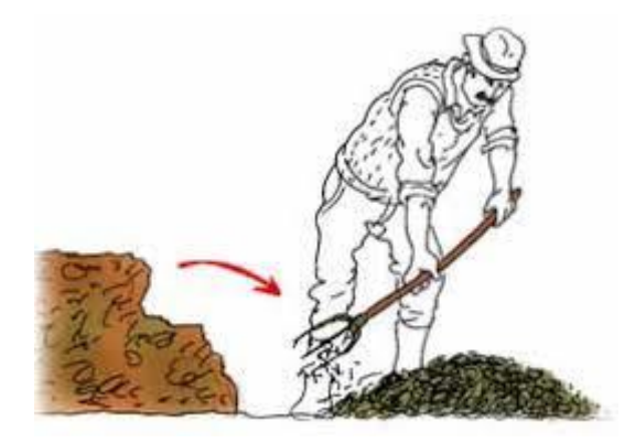
Figure 2. – Curing phase

The stockpile/heap is prepared in a roofed area. Once a week the heap is turned manually (where the operator will use a shovel) to permit the air exchange and watered to adjust the moisture content if this became lower than 40%. It is advisable to measure temperature by a thermocouple connected with a temperature meter. One can expect that in the first months temperature goes higher than 50 °C. Curing can last up to three months until temperature inside the heap reaches a steady value close to ambient temperature.