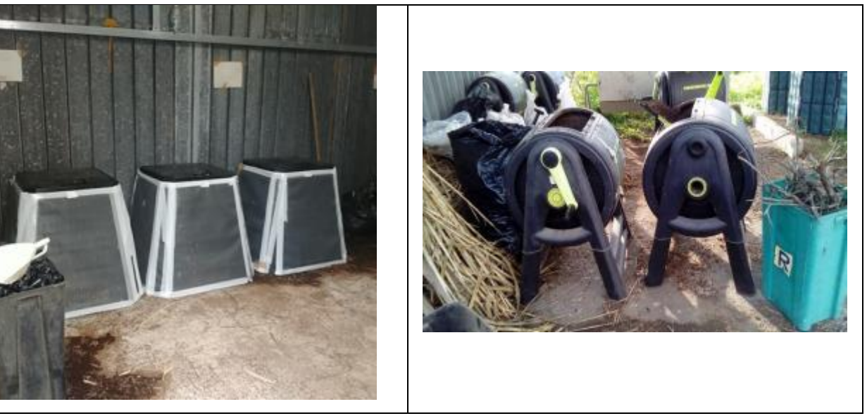
Figure 3. - Domestic composters

It is advisable to start domestic composting in the warm season because ambient high temperatures promote the bio-oxidation process.