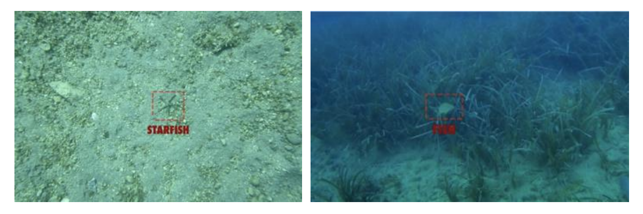
Figure 2 Species recogniscion with Machine Learning Algorithms

The Artificial Intelligence and Machine Learning accompanying drone technology, the applications of these dynamic and vivid innovations in the field of marine surveillance deliberately eases the operations required to be performed. Drone mapping and imagery with the association of machine learning may be so utilized to cultivate optimal algorithms to process the data or images captured. Through Computer Vision, underwater drones are enabled to detect and monitor marine ecosystems, enhancing primitive features in the likes of self -navigation, object tracking, collision prevention techniques, and more.