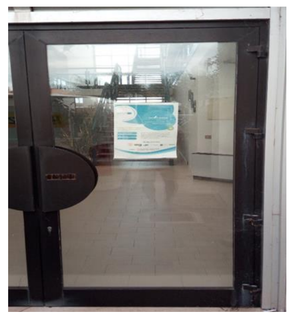
Poster Fano headquarter