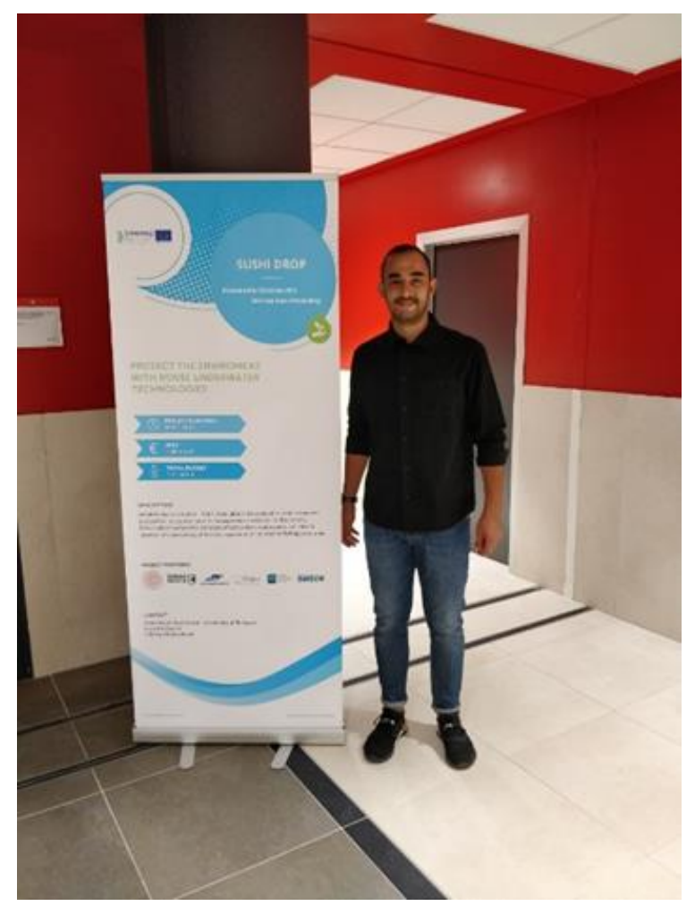
Roll-up Bologna premises