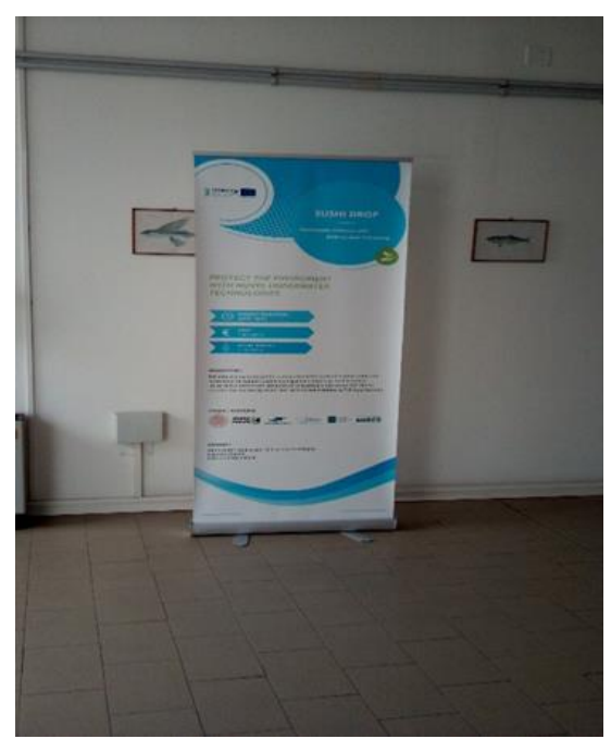
Roll-up Fano headquarter