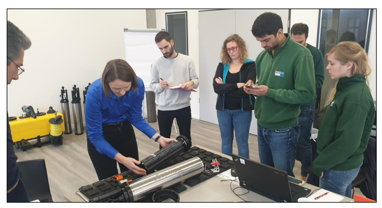
Figure 2 Hands on instrument disassembling on the second operator's training workshop held in Develogic, Hamburg on 12<sup>th</sup> December 2019

All participants were working with its own instruments and had full hands on experience in assembling all mechanical parts that are needed for the proper operation of the SonoVault as well as proper filling of the battery container. No problems were encountered during that part of the workshop. At the end of that part all instruments remained disassembled, opened equipped with batteries and ready for the operation.