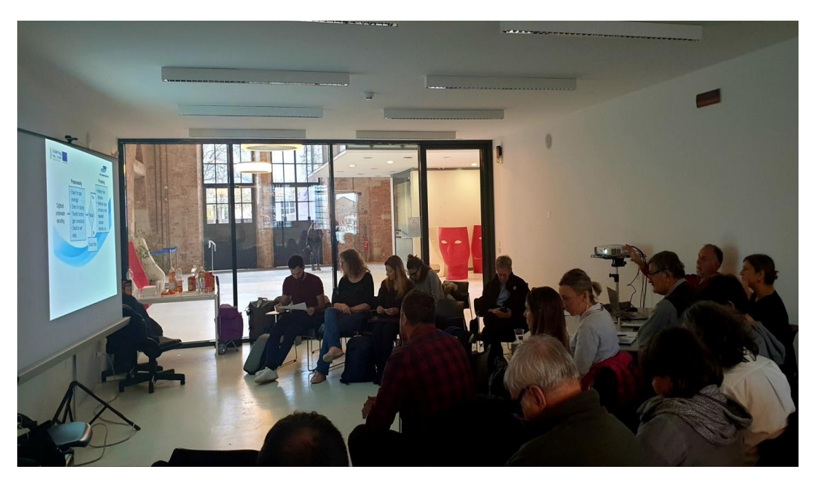
Figure 1 The participants of the first operator's training workshop held in CNR/ISMAR, Venice on 26<sup>th</sup> November 2019