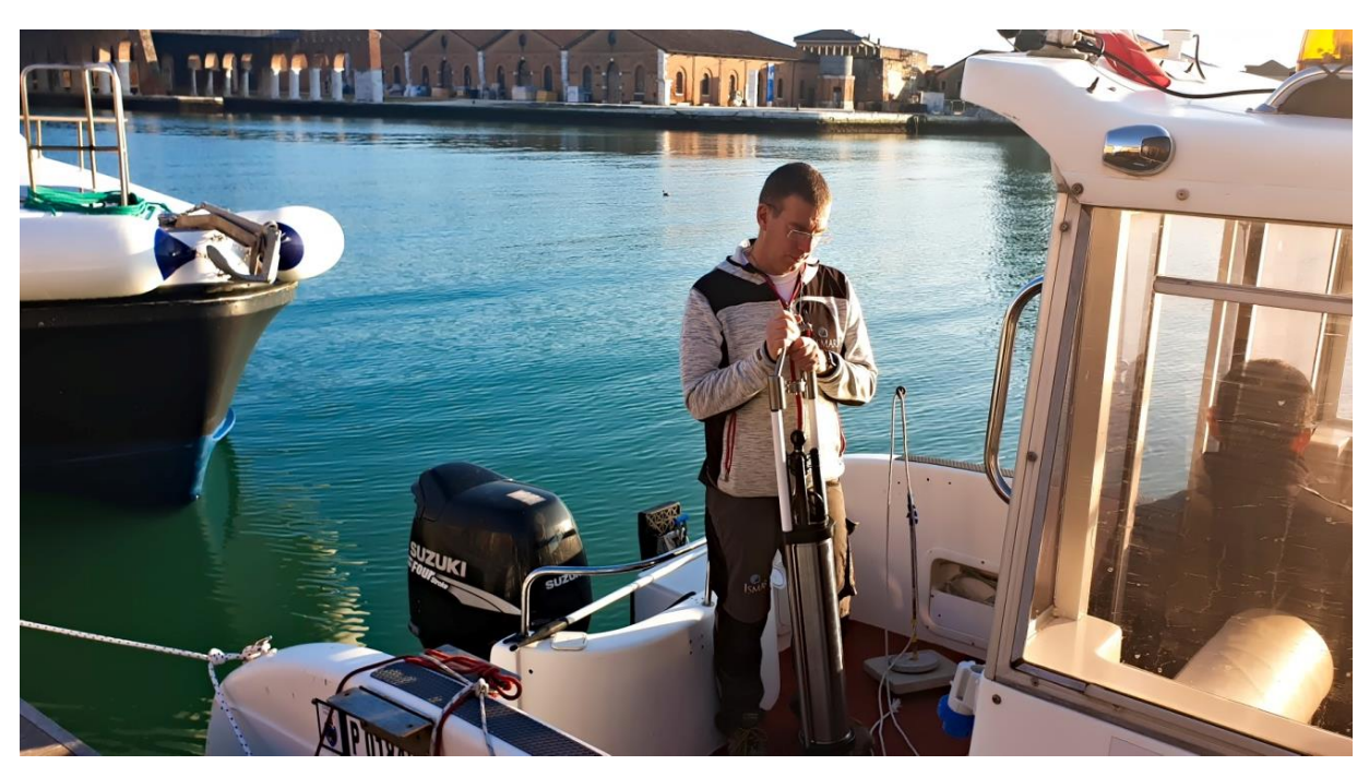
Preparation for the test deployment in Arsenale basin on the third operator's training Figure 5 workshop held in CNR/ISMAR, Venice on 23<sup>rd</sup> January 2020