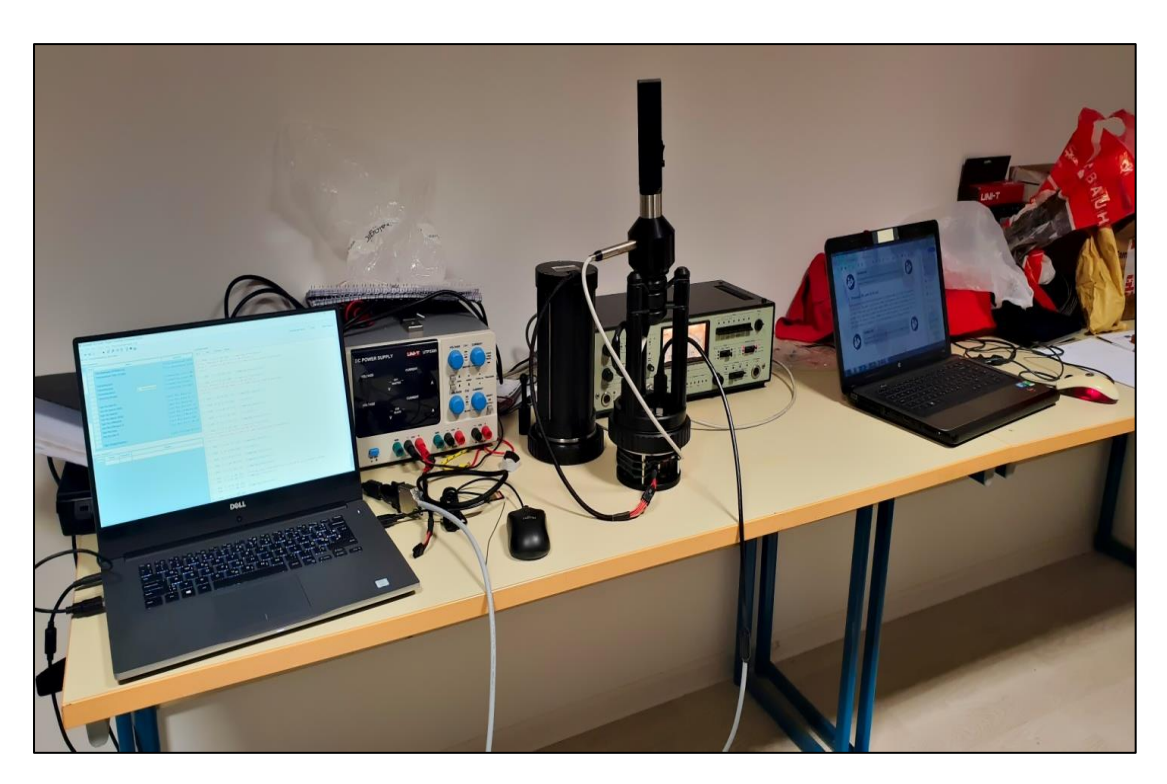
Figure 3 The setup for the calibration check

Due to the fact that calibration parameters were not given at the training workshop in Hamburg but were sent later, the calibration check was performed in IOF laboratory in Split on 13<sup>th</sup> January 2020 (Figure 5). The setup for the calibration check is displayed on Figure 5. The calibration check was performed by pistonophone calibrator Grass 42AC mounted on the hydrophone with the hydrophone adapter SV.PA. The pressure inside adapter chamber was checked with calibrated ½" microphone BK 4149. With the calibration parameters provided by the manufacturer, recorded signal and calculated amplitudes did not match. The problem was communicated with the manufacturer and after parameter corrections, calculation matches recorded amplitude levels. All four instruments were tested for the full functionality and the calibration files for all gain setting and all four instruments were recorded and stored. These files will be the references for calibration files that are to be recorded before and after each deployment.