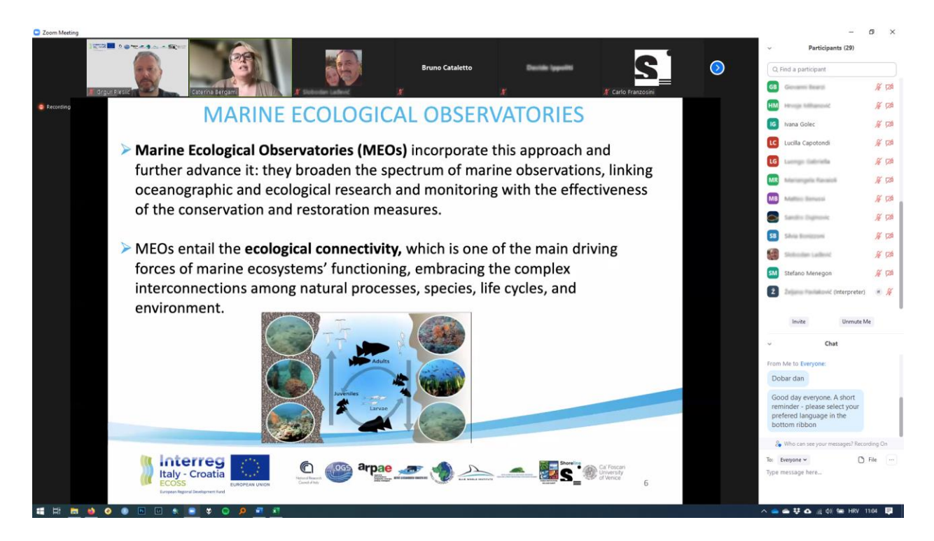
Figure 1. Screenshot of the online Workshop 3 for stakeholders. Participants' names are blurred due to GDPR requirements.

The workshop was recorded and the recording is available on OwnCloud.