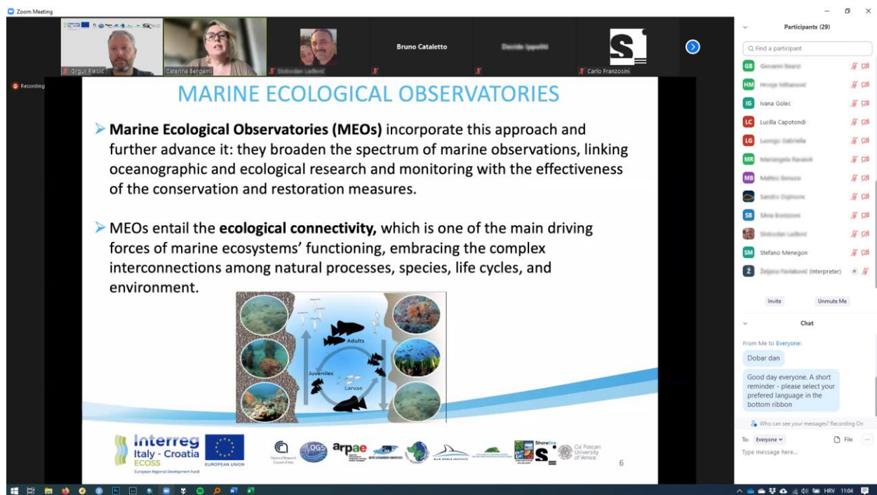
Figure 1. Screenshot of the online Workshop 3 for stakeholders. Participants' names are blurred due to GDPR requirements.

The workshop was recorded and the recording is available on OwnCloud.