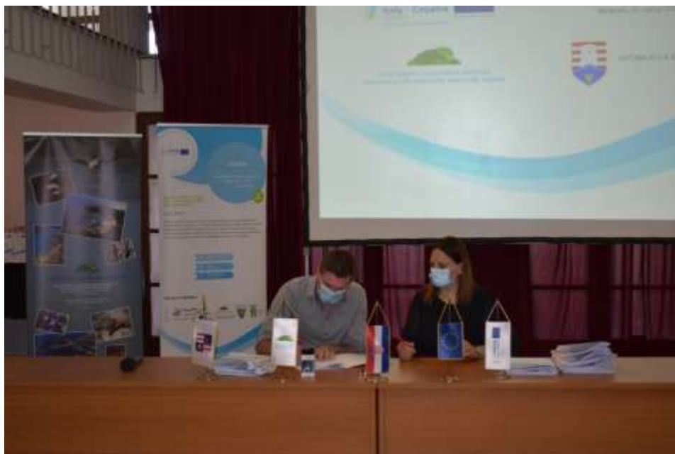
Special Ornithological Reserve Palud - Palù “Natura Histrica”