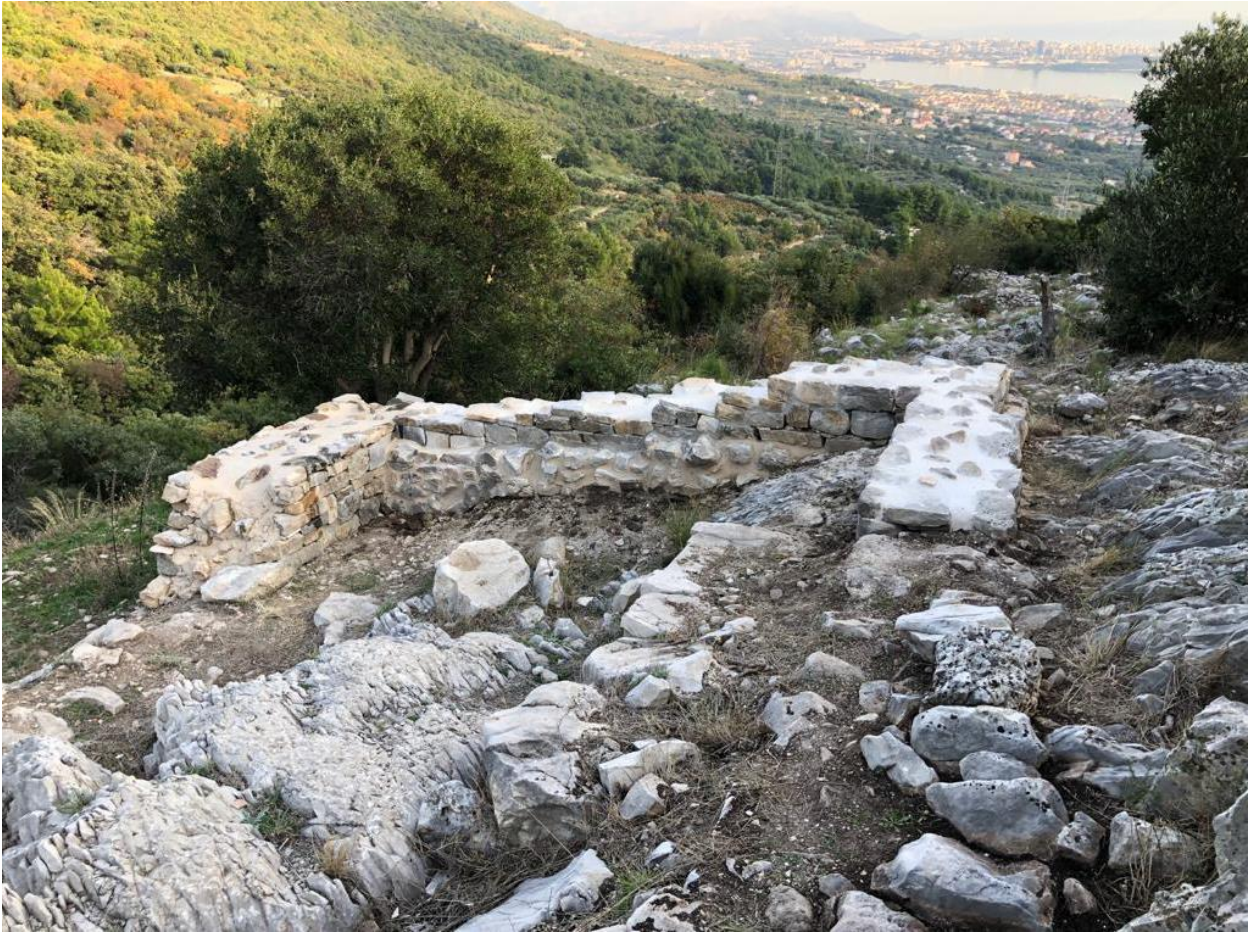
Picture 6. Location of the fortification and reconstruction process