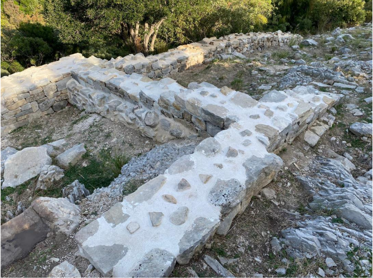
Picture 5. Wall after reconstruction