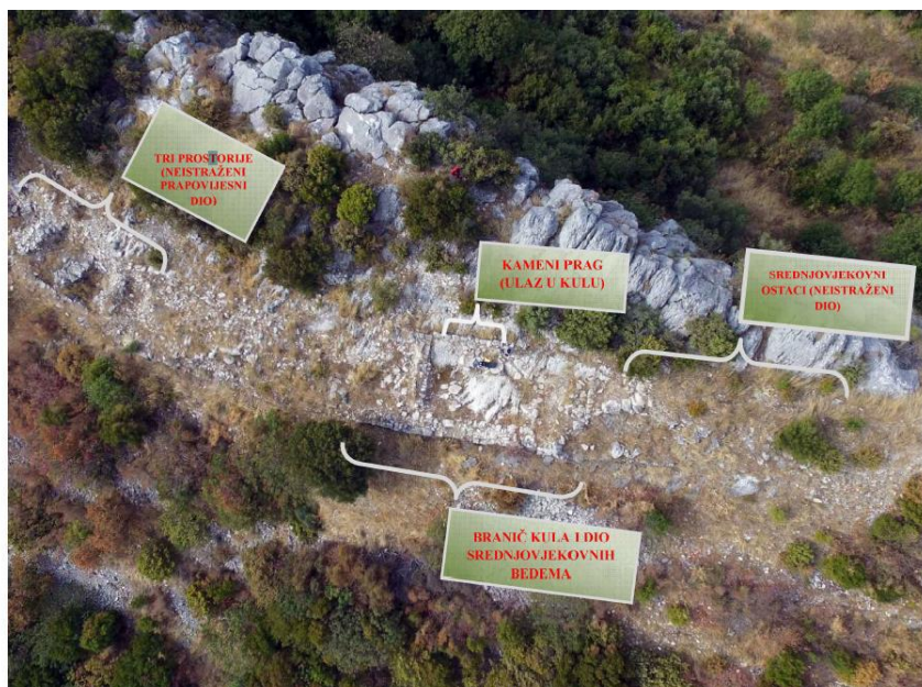
Slika 9. Pogled iz zraka s označenim dijelovima lokaliteta Ostrog - Balavan, izvor: T. Burić.

On the area of hill Balavan, pilot site Ostrog archeological research including two fortification system were conducted. During the summer 2020 the area has been cleared from vegetation and prepared for exploration which took place in following months. Exploration included two historical periods, two fortification systems that are overlapping on a small area. Methodology and research phases are detail presented in document “Study of necessary conservation works on the part of the Ostrog site Balavan and proposal of rehabilitation works for the Ostrog site”, November 2020, prepared by external expertise Kvinar d.o.o.