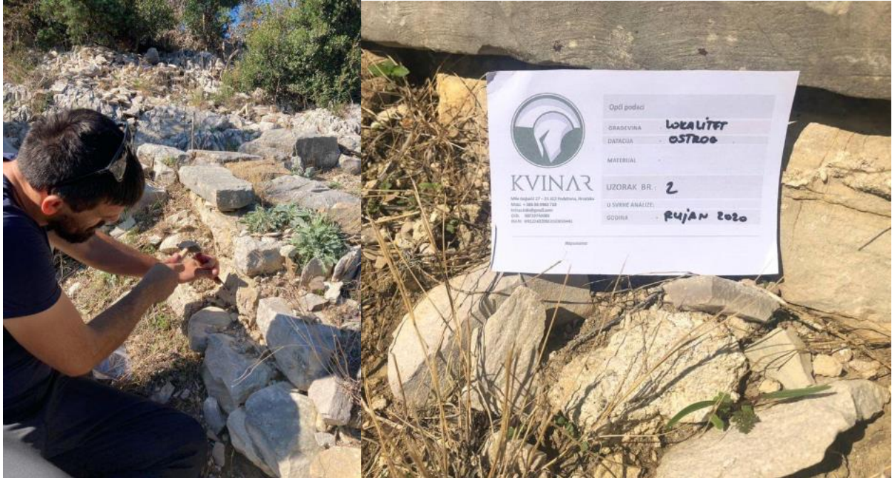
Picture 2. Research and labeling of the site in the progress