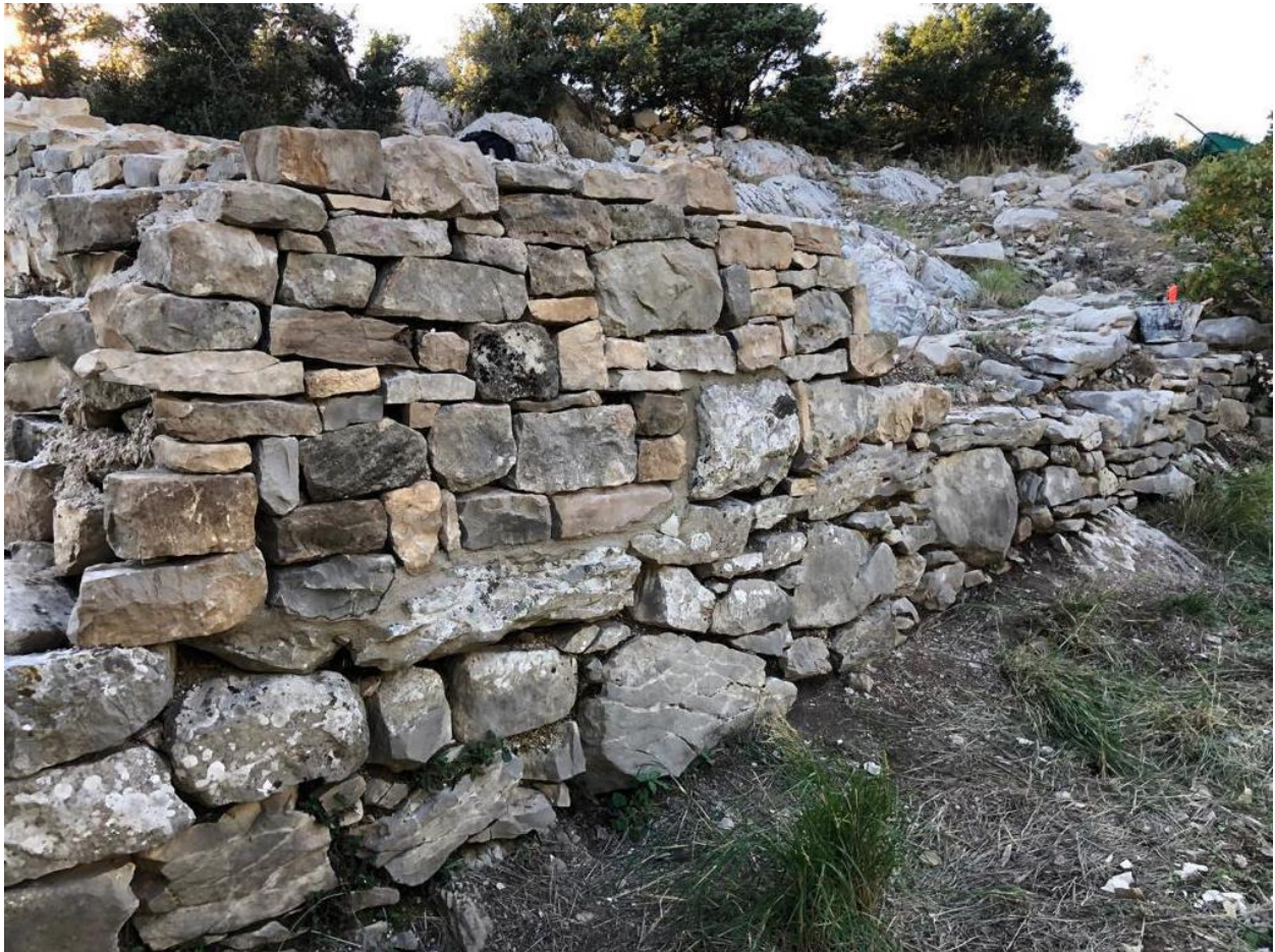
Picture 4. The upbringing of the original wall

The second phase of the project was the restoration and conservation of the fortification system. The activities took place during the summer of 2021. In this period, parts of the fortification system were reconstructed and preserved in order to restore the overall picture of the site. Methodology and tools used in that activity are presented in “REPORT ON CONDUCTED CONSERVATION AND RESTORATION WORKS ON THE PART OF THE SITE OSTROG - BALAVAN - II. WORK PHASE” October 2021. On the site wall construction was carried out through the anchoring of loose stones and basic landscaping to make the site more accessible.