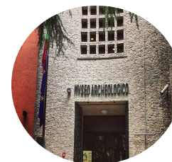
Archaeological Museum Adria