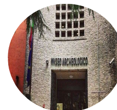
Arheološki muzej Adria