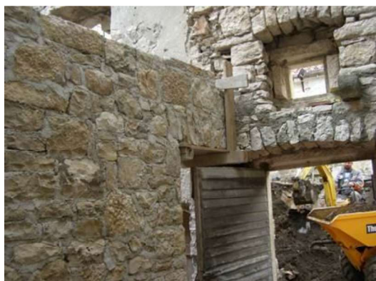
Construction of the House of Marko Polo in Korčula

The texts will be scanned, digitized and illustrated and then collected within an IT platform available to users, remotely and by web, or via a computer station installed directly inside the visitor center. This large digital archive will also host some sections dedicated to the history, archeology and environmental context of one of the most visited places in the province of Ferrara.