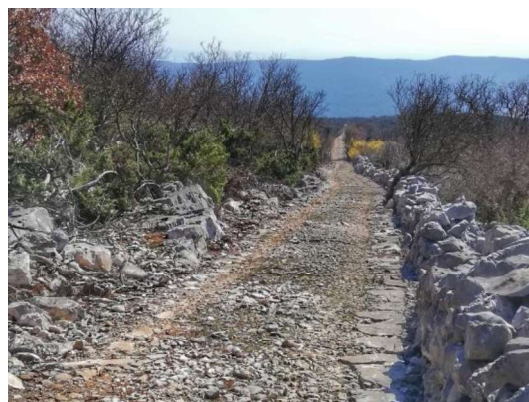
Restoration of historical island routes in Cres

After the complete reconstruction, the Town of Korčula will have a beautifully restored medieval house with an exhibition space that will present the story of the life and travels of Marco Polo and the historical connection between Town of Korčula and Venice.