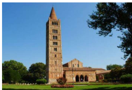
Digitalization of the historical archive of the Pomposa Abbey