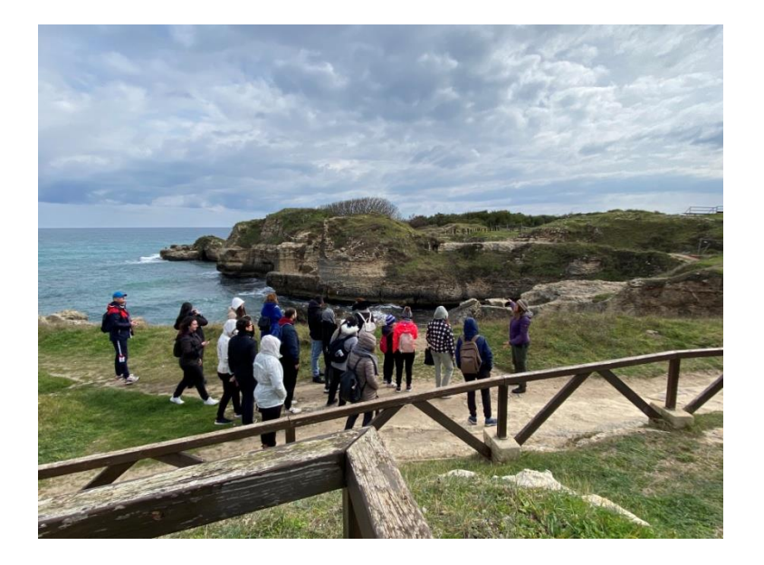
Fig. 1 – Guided tour at Roca.