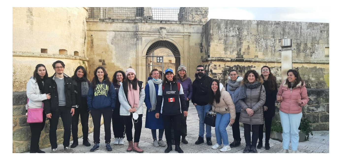
Fig. 3 – Guided tour at Acaya

At the end of the training, the partecipants have developed: