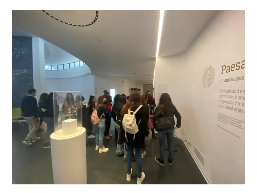
Fig. 2 – Guided tour at Castromediano Museum.