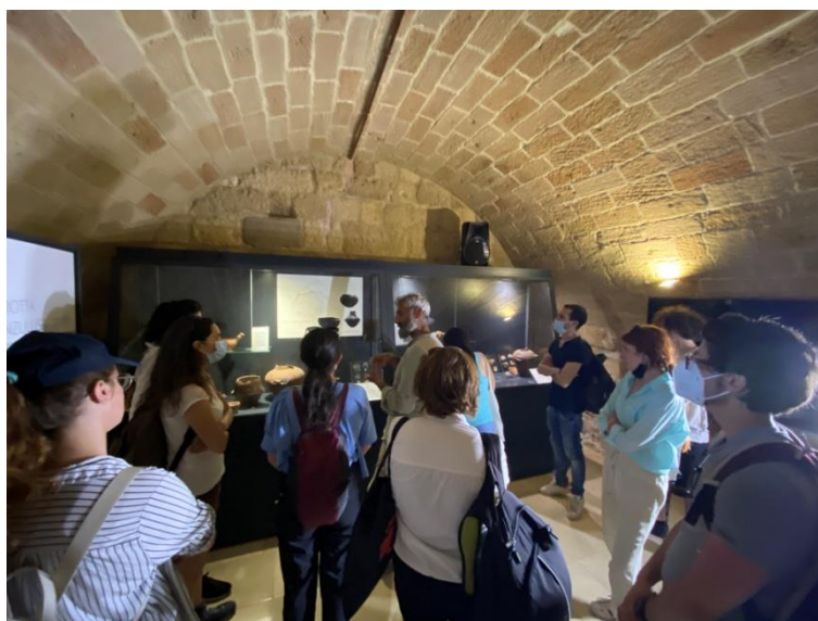
Fig. 5 – Guided tour at the Museum of Castro