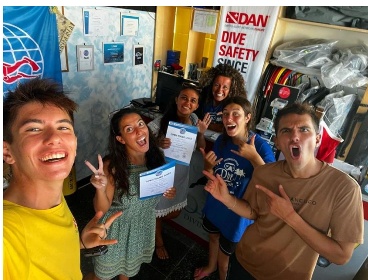
Fig. 6 a,b – Training for the diving licence