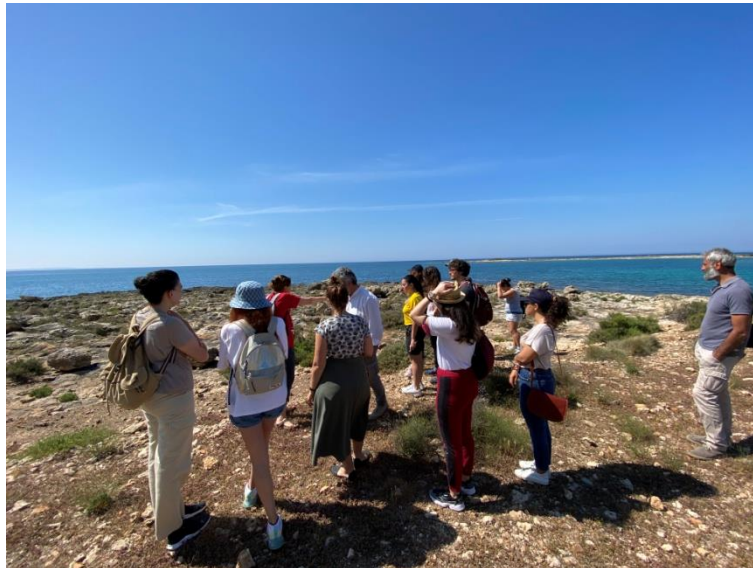
Fig. 4 – Guided tour at the MPA of Porto Cesareo