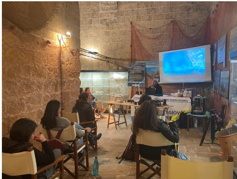
Fig. 1 - Making the invisible visible: underwater photographic and video shooting techniques. The use of the drone and external shots

Furthermore, field – underwater activities have been carried out: diving prospecting and video-photographic documentation of the submerged sites of the MPA of Porto Cesareo (5 hours in the frame of the UnderwaterMuse Final Event), of the Natural Reserve of the State Le Cesine (Vernole, Lecce) and of the Emperor Hadrian pier in S. Cataldo (Lecce).