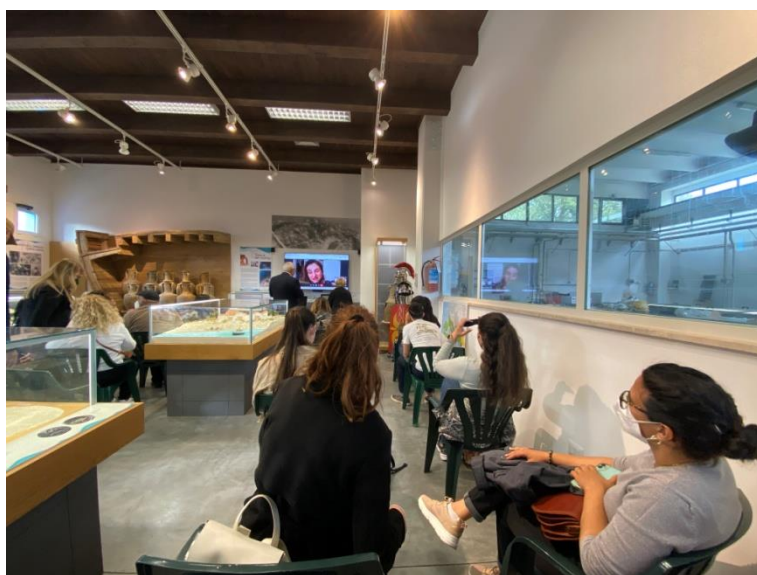
Fig. 3 – Lesson and guided tour at the Ancient Sea Museum of Nardò