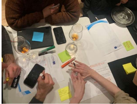
Photo 3 TEMPUS INNOVATHON, RAVENNA PILOT SITE