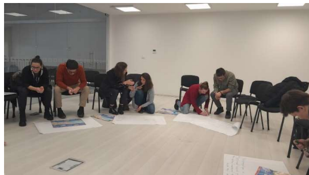
Photo 4 TEMPUS INNOVATHON, RIJEKA PILOT SITE

The participants of the TEMPUS INNOVATHON, young people aged from 18 to 35 formed into teams, worked on developing a new product or service based on innovative solutions with the aim of contributing to the development of tourism and the economy in their pilot areas.