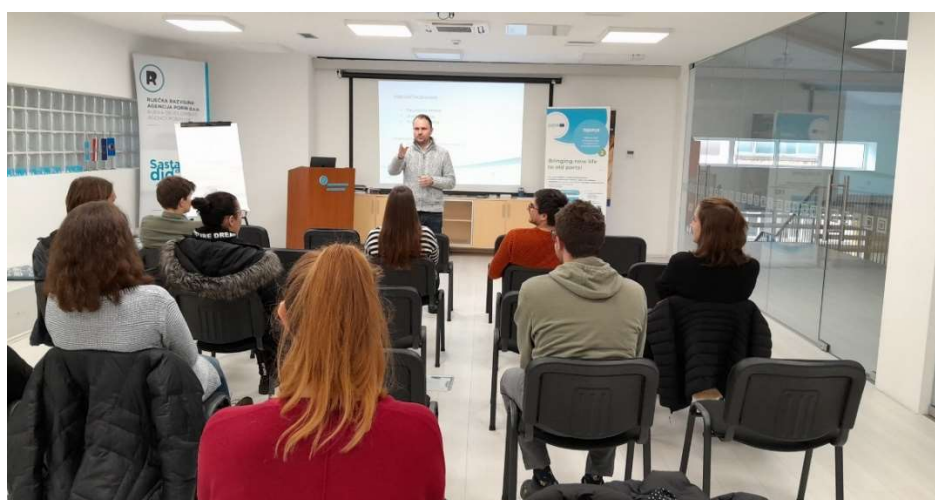
Photo 1 TEMPUS INNOVATHON, introduction, Rijeka

An INNOVATHON is an Open Innovation contest, a “marathon of ideas” to stimulate the participants with challenges aimed at contributing to innovation processes. Similar to hackathons, innovathons are focused on finding innovative and creative solutions and drawing inspiration for new actions, products, and/or services. Participants are invited to design an innovative project drawing on their technical knowledge, creativity, spirit of adaptation, problem-solving skills and teamworking attitude: during the event participants are grouped into teams and will have to collaborate to find shared solutions to the challenge, contributing their individual experience and differences and elaborate ideas collectively.