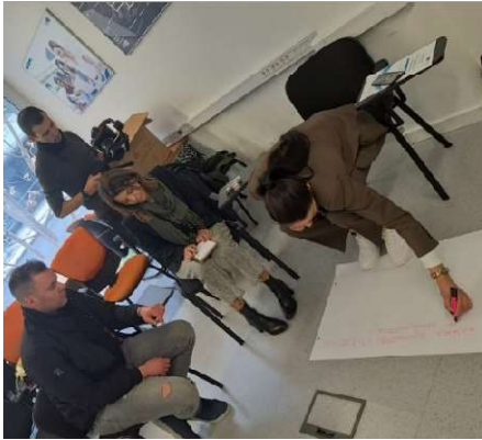
Photo 2 TEMPUS INNOVATHON, SOLIN PILOT SITE

In March during the period from 2nd - 9th, in each pilot city of the TEMPUS project, i.e. in Rijeka, Ravenna and Solin, TEMPUS INNOVATHONS were held in concept based on the hackathons with its specifics, such as the duration for a total of twelve hours in one day, and challenges of the event.