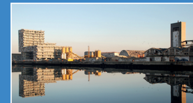
Ravenna's Docks area, rich in industrial archaeology.