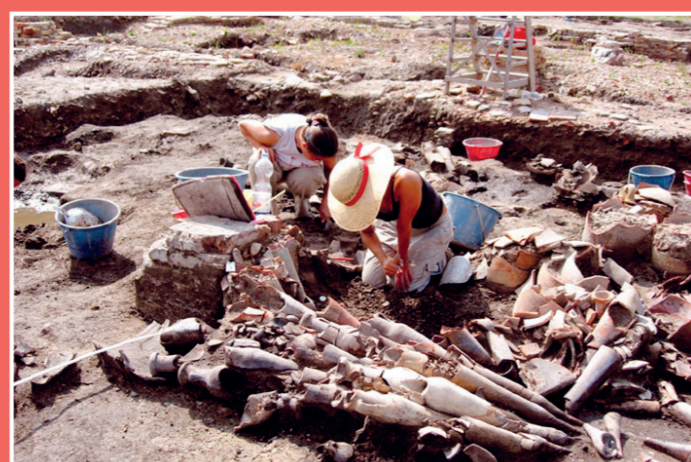
Archaeologists uncovering amphorae and other evidence of the trades during the Roman era.

The fluxus of MATERIALS tells the story of the goods passing through Ravenna in time, influencing many features, from their means of transportation to the very infrastructures of the ports they crossed. Ancient trades have merged into local traditions, buildings, and works of art, seeping into daily life up to the present day. Among the many, an example is given by the exportation of the locally produced wine, dating back to the Roman era, or of building materials such as marble, used also in the local great tradition of the mosaic.