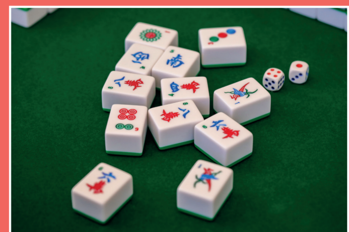
The Chinese game of Mah Jong, a local tradition born from trade and exchanges.

The fluxus of CULTURES narrates the strong and persistent relationships with distant places and cultures that, starting from the port, have become rooted in the city and have ended up being its distinctive features. A glimpse of such relationships can be caught in their influence on art and architecture, on food, and even on games, as in the case of the Mah Jong, a traditional Chinese game that reached Ravenna through traders to become a pastime so deeply rooted as to compete, in appreciation, with the most traditional card games.