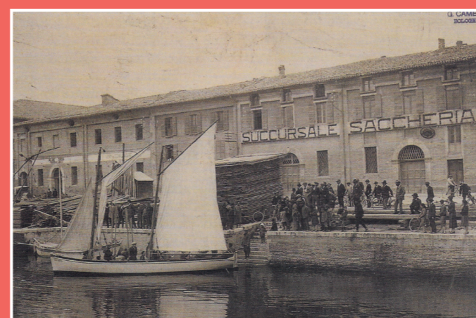
A souvenir photo from the Casa Matha archives taken in the Ravenna's Docks in the 1920's.

Along with goods, there is always a movement of people. The fluxus of PEOPLE tells their life stories. They can be workers employed on ships or in the port, or merchants coming and going for their business: storytellers of trades and crafts testifying to a very rich variety of services and products offered. They can also be long gone kings who come to Ravenna to be buried in monumental splendor, or saints, as relics and icons from distant lands becoming symbols of the history and tradition of Ravenna.