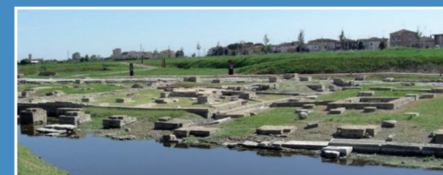
Ruins of the warehouses in the Ancient Port of Classe Archaeological Park.

A simpler, widely available, and cheaper way to enjoy a small tour at sea, without getting too far from the coast due to safety regulations, is the "pedalò" (paddle-boat): a type of recreational pedal-powered watercraft derived from the rowing watercraft "pattino", also known as "moscone", which constellated the Riviera in its roaring days as a touristic Mecca in the first half of the 20th century. Initially made of wood and now made of fiberglass, the pedalò is driven by pedals, with a lever to control the rudder. It offers a floating platform often equipped with a slide: in the open sea where no islands or other structures are available for swimmers to take a break and catch their breath, or simply tanning and enjoying the sun, this kind of watercraft has always been well loved by locals and tourists alike.