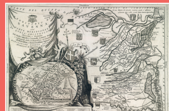
1690's map of Ravenna's territory, drawn by Vincenzo Coronelli.

The fluxus of TECHNIQUES explores all the techniques and technologies needed for sailing and to sustain the port life. Shipbuilding and architecture, both heavily influenced by functionality, have evolved in time with technology, as testified by archaeological remains and ruins in the area, including port structures such as piers and banks, warehouses, and sighting structures. Among the navigation techniques, cartography is especially relevant, doubling its importance in time also as an incomparable source of historical information.