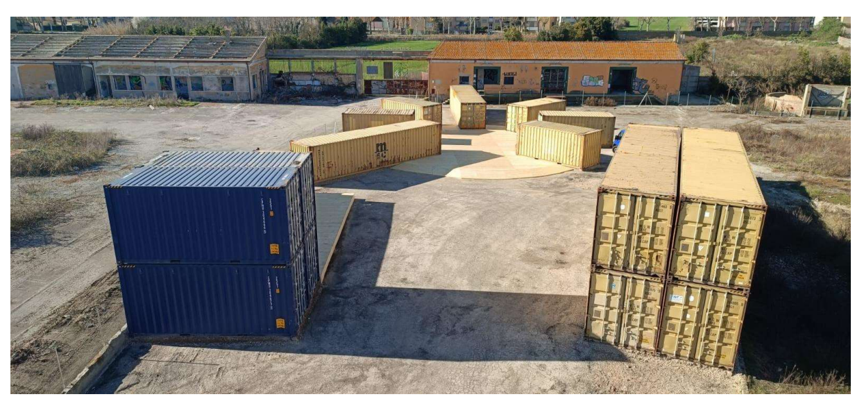
Figure 1 - Air view of the intervention area after the conclusion of the works

The rich schedule of temporary actions envisioned to activate and promote the transformation of the Agrarian Consortium area, named "Tempus fugit", have been realised in the span of approx. 3 weeks, in preparation for and drawing attention to the launch weekend (25-26 march, 2023), during which the majority of the temporary actions took place. In this format, the TUA assumes the role of prototype location and promoter of a CCI-led redevelopment, in coherence with the strategy elaborated by Ravenna's LAG (OP1). In addition, for the time allowed by the agreements signed with the property in the framework of the TEMPUS project, the Ravenna TUA can become a space temporarily returned to the community. A space that, according to the rules shared with the LGG-Local Governance Group (D4.4.3), of which the CCIs selected for the implementation of the activities will be a central part, can be used for the organization of different types of events (from festivals to exhibitions; from public meetings to private parties).