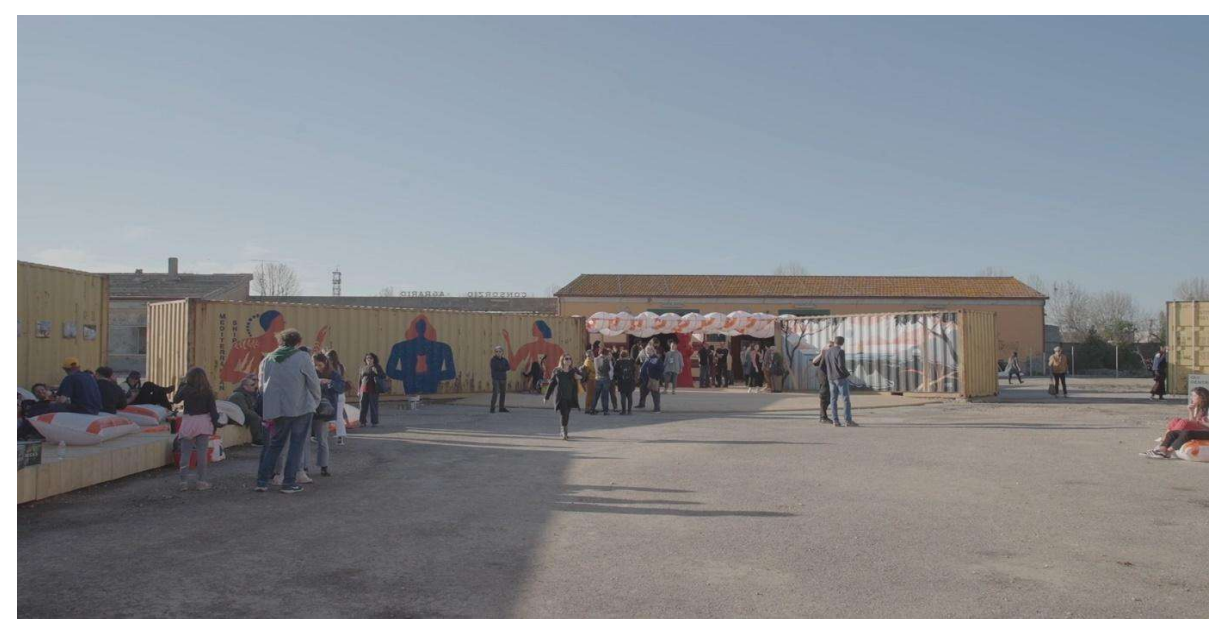
Figure 2 - TEMPUS Fugit event – square view