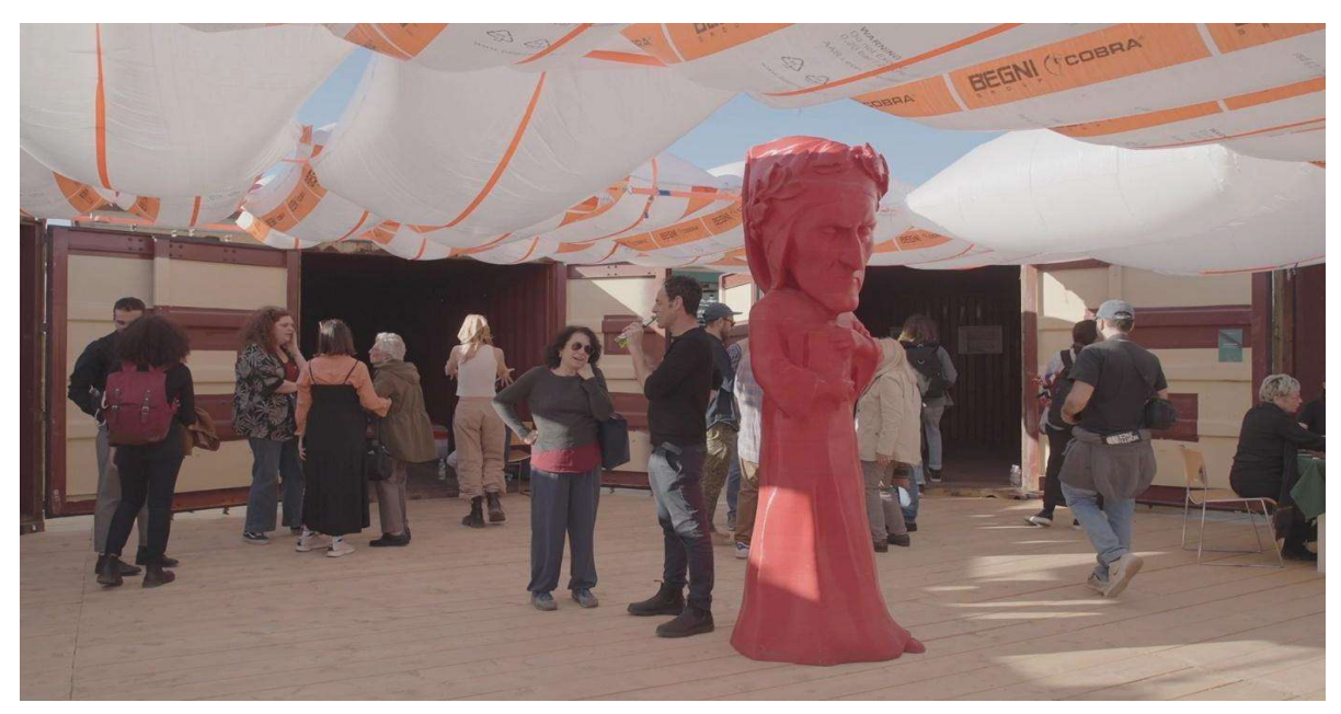
Figure 3 - TEMPUS Fugit events