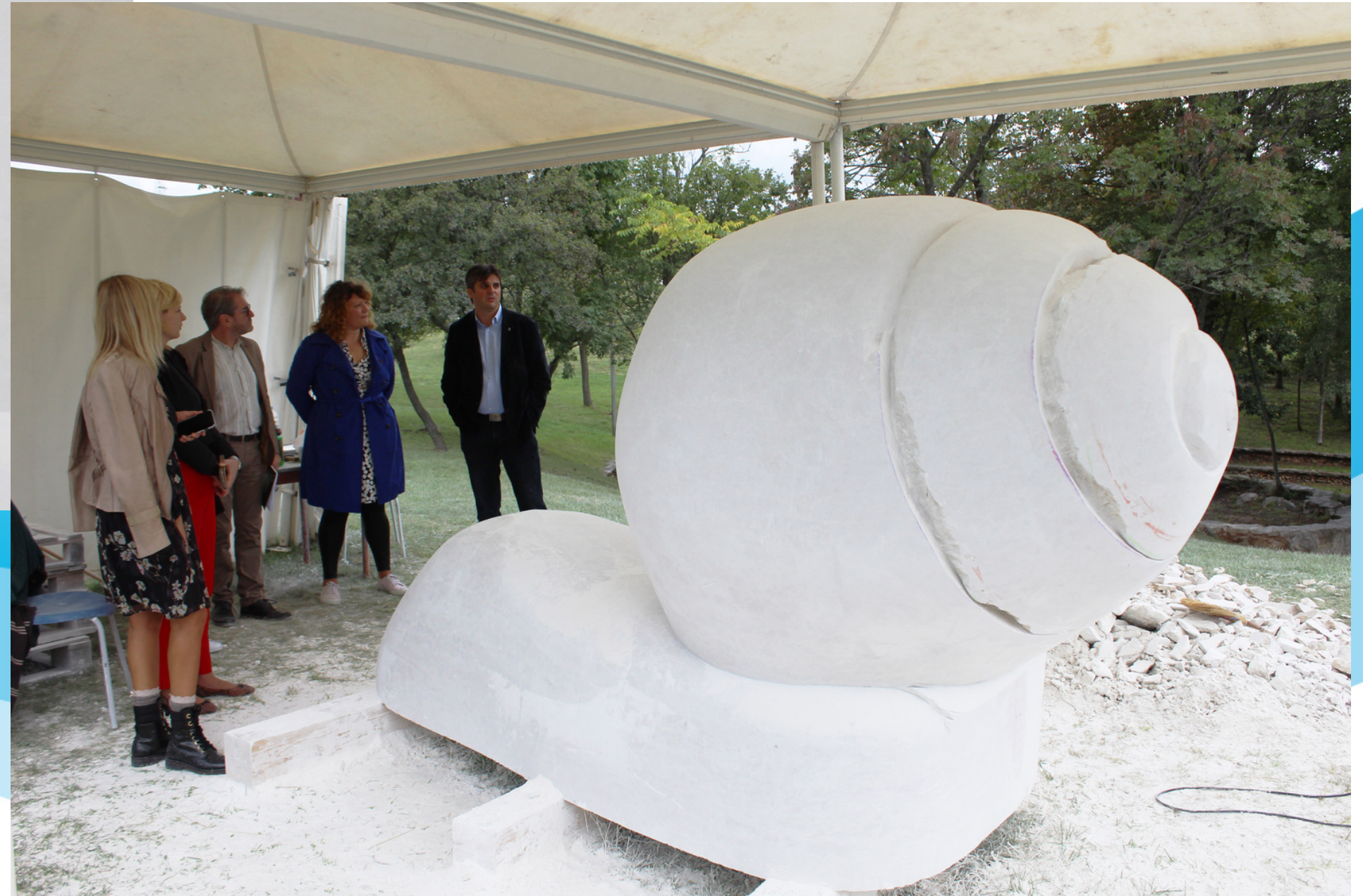
Carving snail in process.