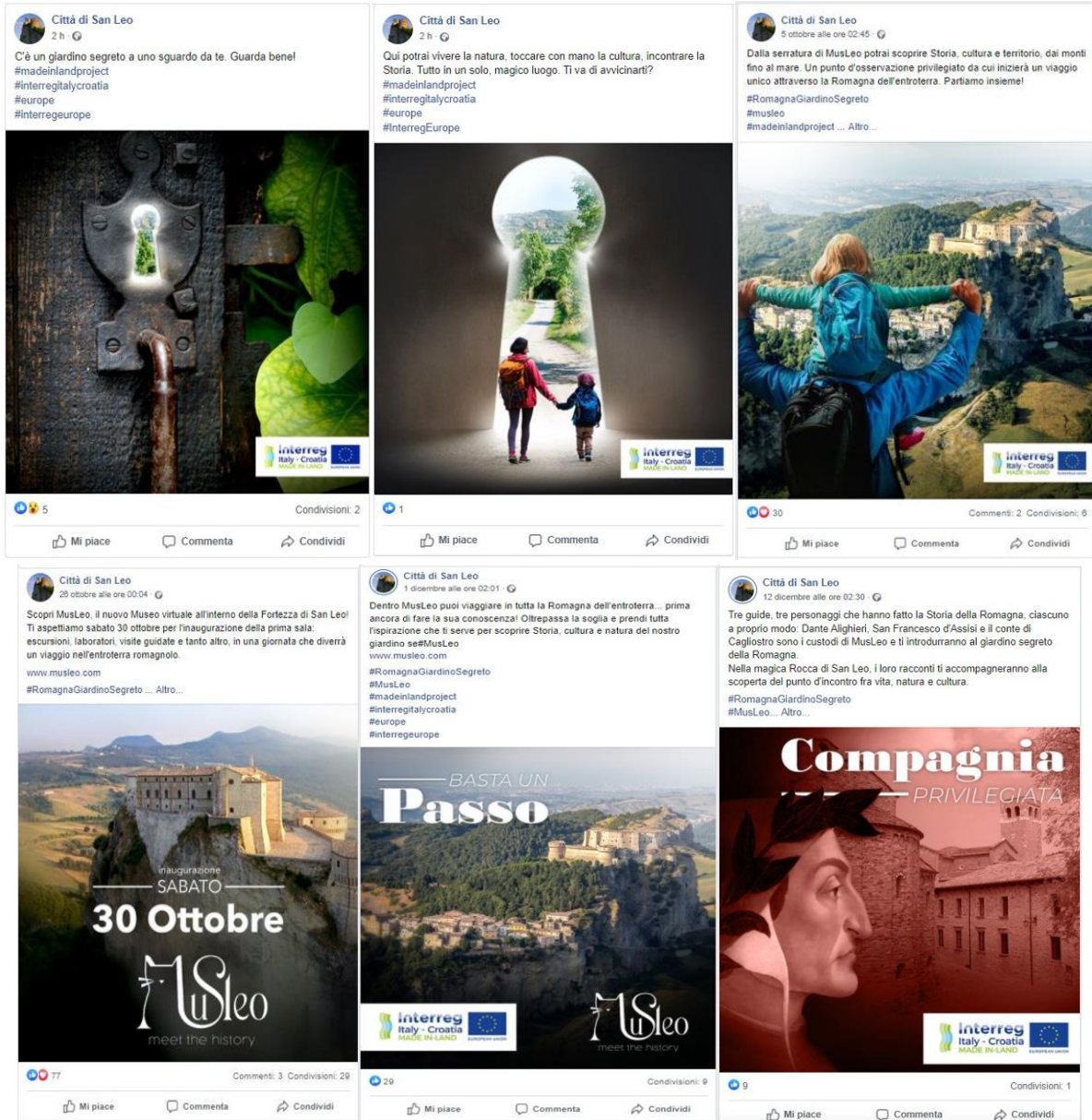
Some of the posts published with the online communication campaign