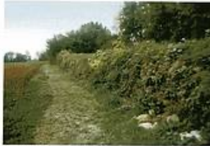
L'ingresso di rianzosa a nord del Castelliere di Rive d'Arcano.