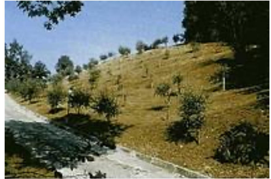
Località "Zivade" nel quale è stato realizzato nell'età del bronzo il Castello