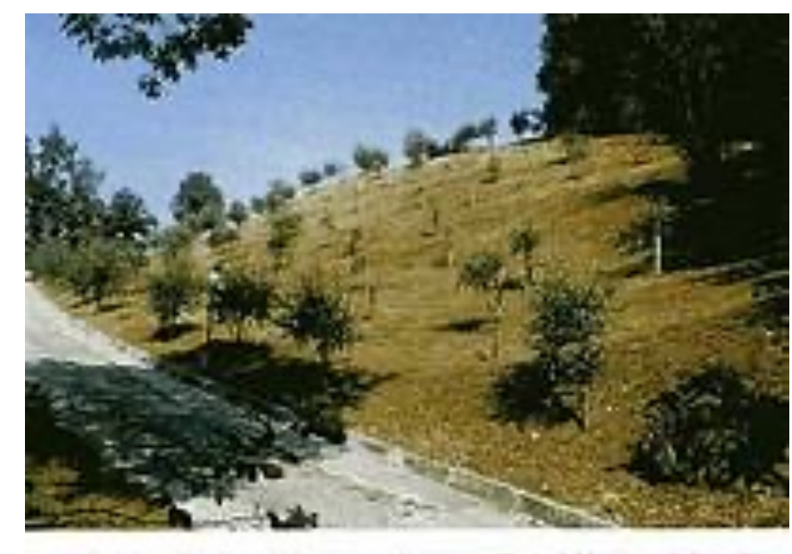
loculità "Zirente" sul quale è stato multizzato nell'età del brompo il Castelliere