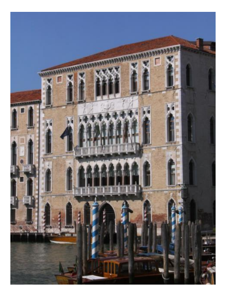
Fig. 3 - Palazzo Foscari seen from San Tomà

During the Second World War Ca 'Foscari continued its activities without interruption, aided by the fact that the historic center of Venice was spared from bombing. In 1943, after the fall of fascism, it was voted for the return of Trentin and Luzzatto and the latter was re-elected rector in 1945.