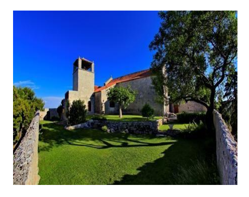
Fig. 1 - The Benedictine monastery of Saints Cosmas and Damian

- The Benedictine monastery of Saints Cosmas and Damian (Ćokovac)