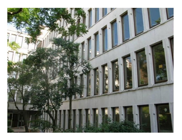
Fig. 4 - View of the Malcanton Marcorà headquarters