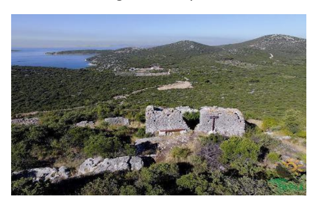
Fig. 2 - the Castle of Ugrinić family

- Large cotes-known as the Castle of Ugrinić family in the wood "Crnike"