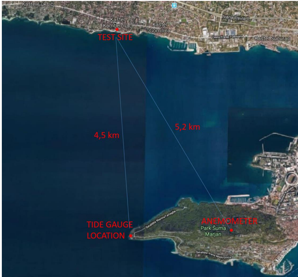
Figure 2. Location of tide gauge station