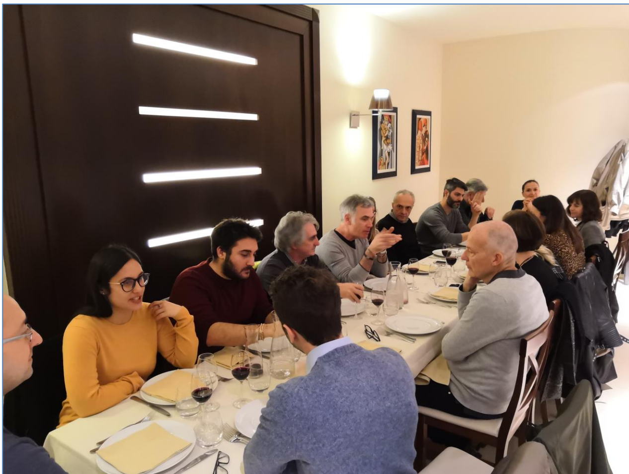
PMO-GATE Project kick-off meeting – Social Dinner