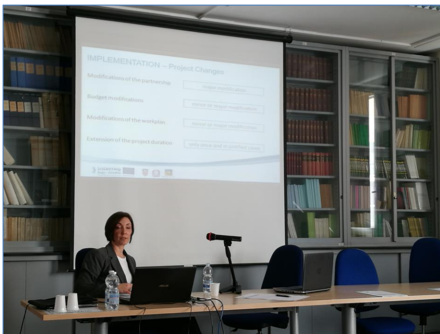
PMO-GATE Project kick-off meeting – Project implementation basics