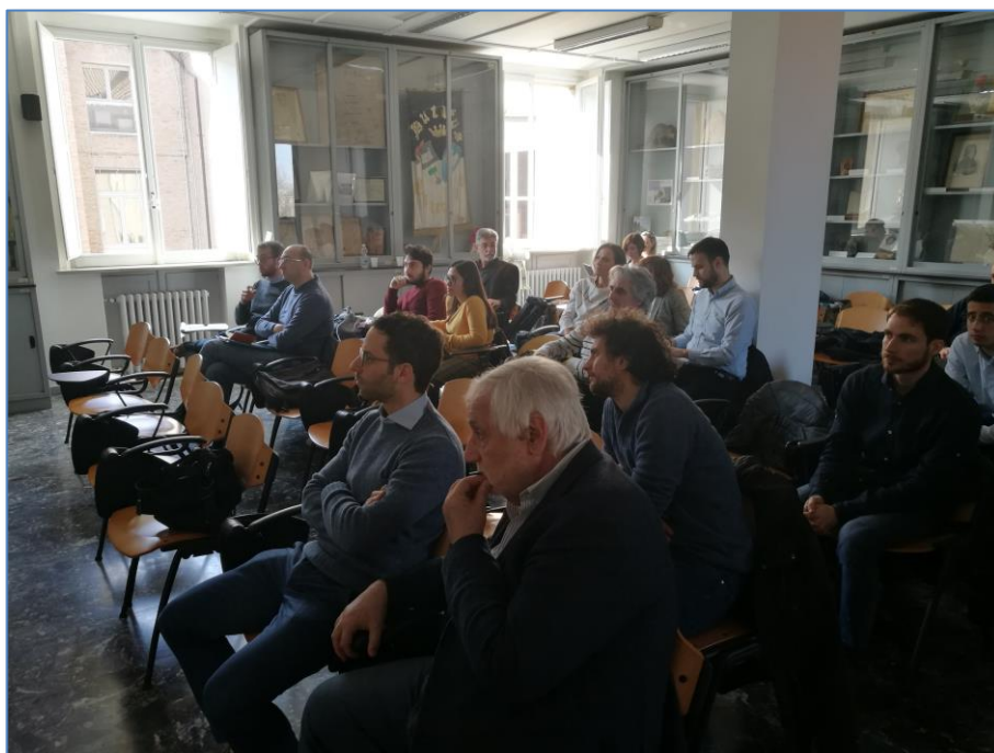
PMO-GATE Project kick-off meeting – Audience