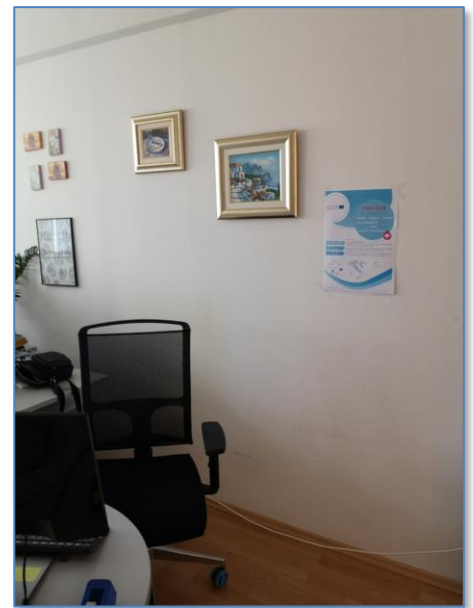
The poster at the entrance and in the offices to the RERA SD