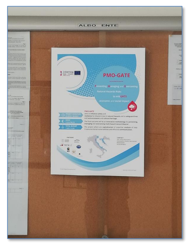
The poster at the entrance to the OGS – Trieste