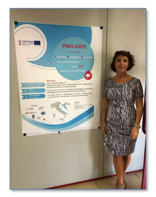
The poster at the entrance to the INGV - Rome