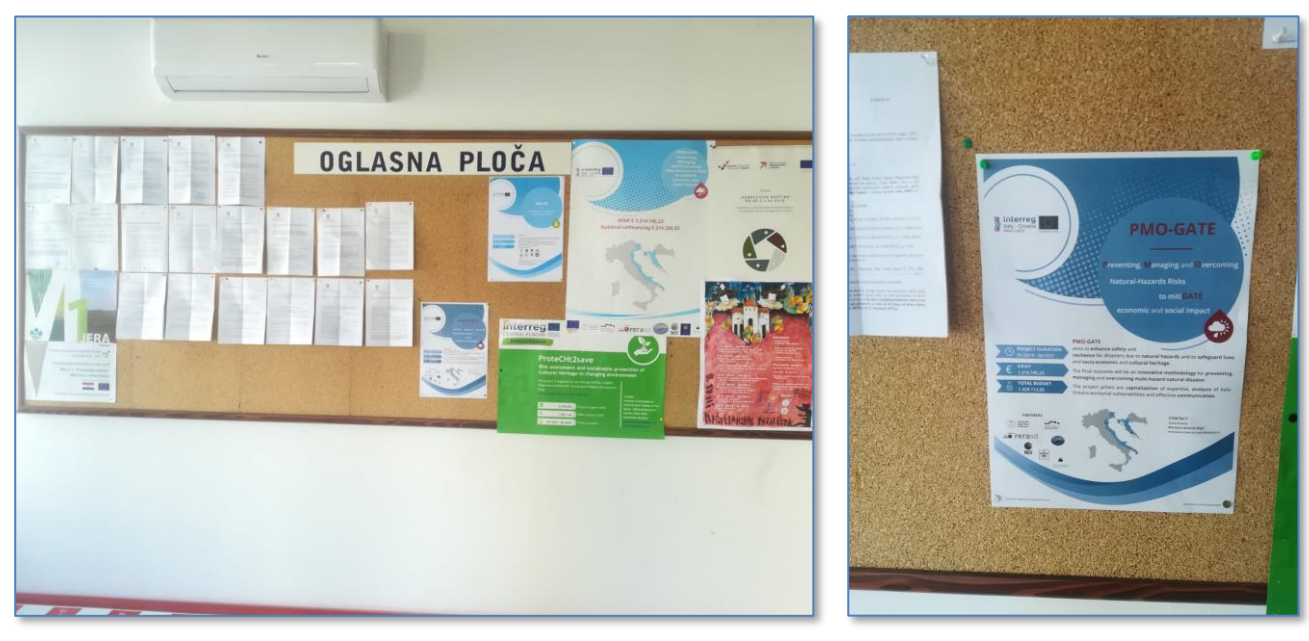
The poster at the entrance of Municipality of Kastela