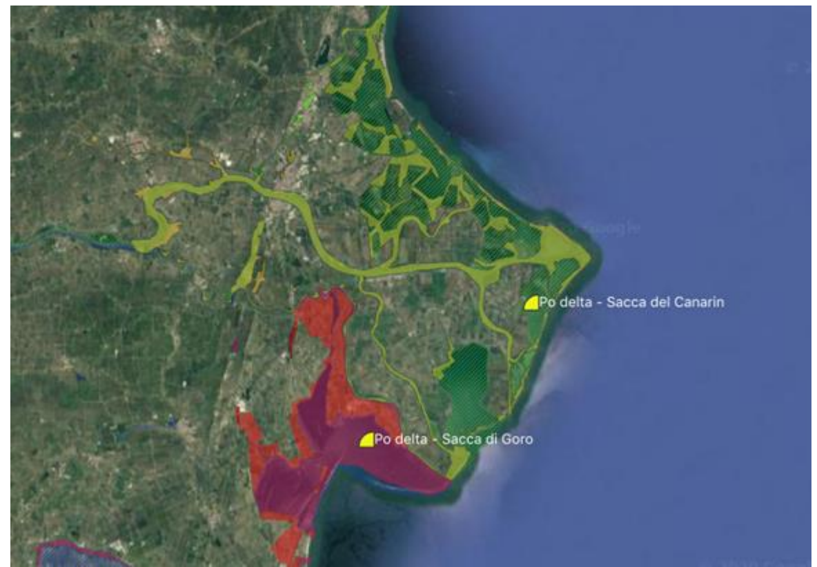
Figure 1 Po Delta Park of the Veneto Region (green) and Po Delta Park of Emilia Romagna (red). SCI-SAC and SPA are highlighted with a dashed pattern. Location of the two focus sites of Canarin and Goro.

have been promoted and set in practice in the last 40 years, with results the most variable, from almost irrelevant to very promising.