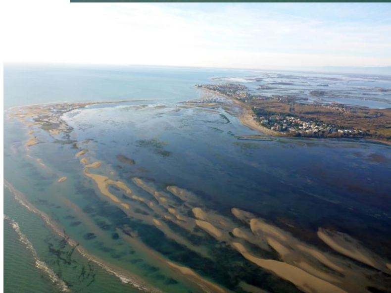
Figure 3-26 The western part of the Banco Mula di Muggia: the sandy bars and the muddy intertidal zone.

In the pilot site two areas are designated in the Natura 2000 network (Figure 3-27): SPA Valle Cavanata e banco della Mula di Muggia IT3330006 and SPA Foce dell'Isonzo - Isola della Cona IT3330005, both designated also as SAC.