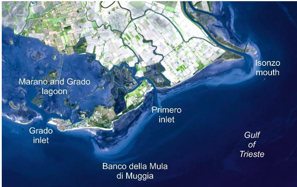
Figure 3-24 Overview of the study area.

The area is well connected by land, air and sea. Two regional routes connect Grado to the highway A4 and Trieste is about 1 hour of trip by car. The Trieste airport is about 20 km and railway stations are at the same distance. A seasonal service connects by boat Grado to Trieste and an efficient cycling network connects the site to the mainland.