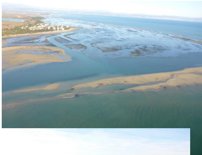
Figure 3-25 Aerial view of the Banco Mula di Muggia.

The succession of sandy bars (between -2 m and -5 m) if the Mula di Muggia is arranged in the form of an arc and represents the outer limit of a wide muddy intertidal area partially covered by seagrass (Figure 3-26). Historical data document the presence of the bank morphologies since 1822, long time before the urban development of the area. The present Isonzo delta consists of a delta structure stretched out along the mouth of Sdobba, which became the only distributary channel after the occlusion of the Quarantia branch in 1937. It has a typical river-dominated form, with a single elongate distributary, about 1300 m wide at the base, and 700 m wide at the mouth, extending ca. 1 km in NNW-SSE direction. A series of sandy bars characterize the delta front.